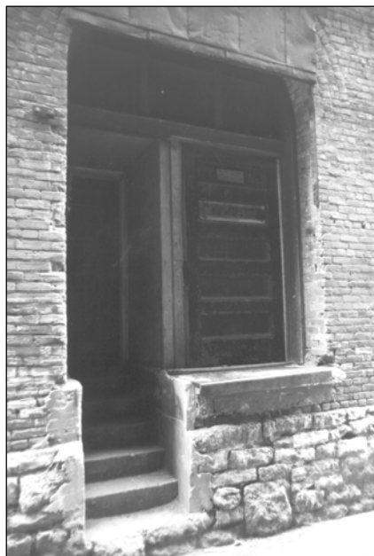
Plate 4 – 88 Arthur Street, altered loading dock, 1970.