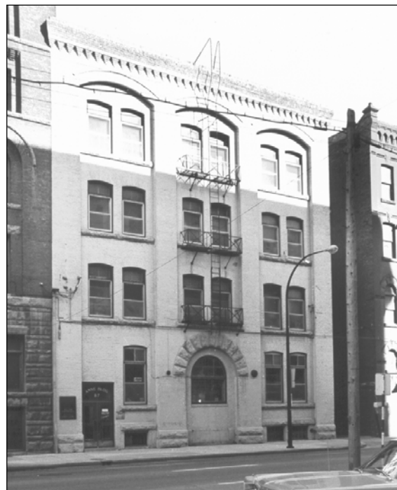
Plate 2 – 87 King Street, the Anne Building, 1970.