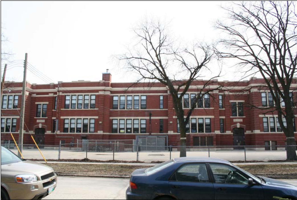
Rear (west) façade, 2009