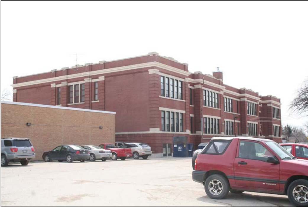
Rear (west) and north façades, 2009

East (1930-1931) and Telephone Exchange Building, Elkhorn, Manitoba, 1932. The brothers have been given 10 points by the Historical Buildings Committee.