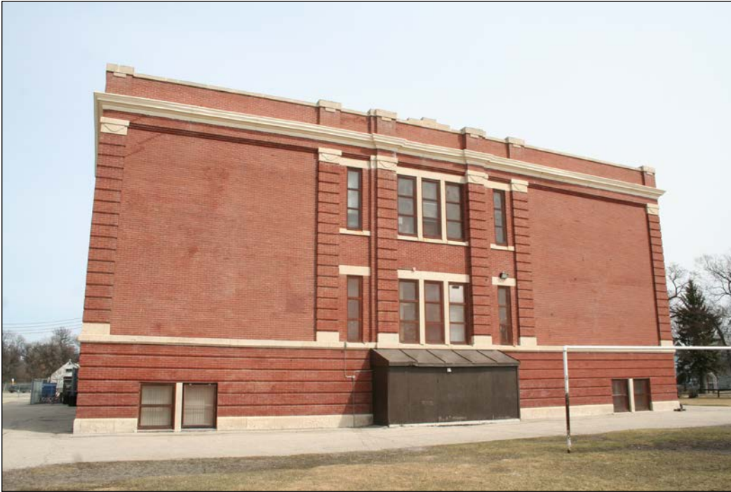
South façade, 2009

The north and south façades were designed with several window openings on each floor; the north end includes two one-storey additions. The rear (west) elevation includes two entrances, marked “BOYS” and “GIRLS”.