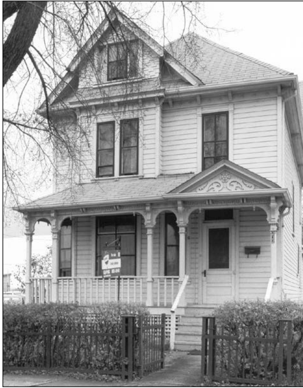
Plate 1 – 232 Bell Avenue, Penrose House, 1986.