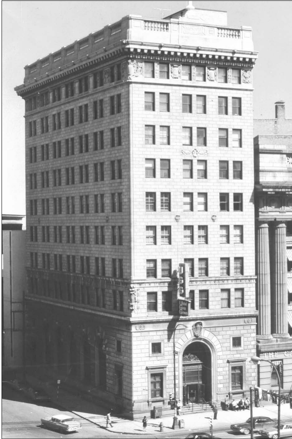
Plate 1 – 395 Main Street, Bank of Hamilton Building, 1969.