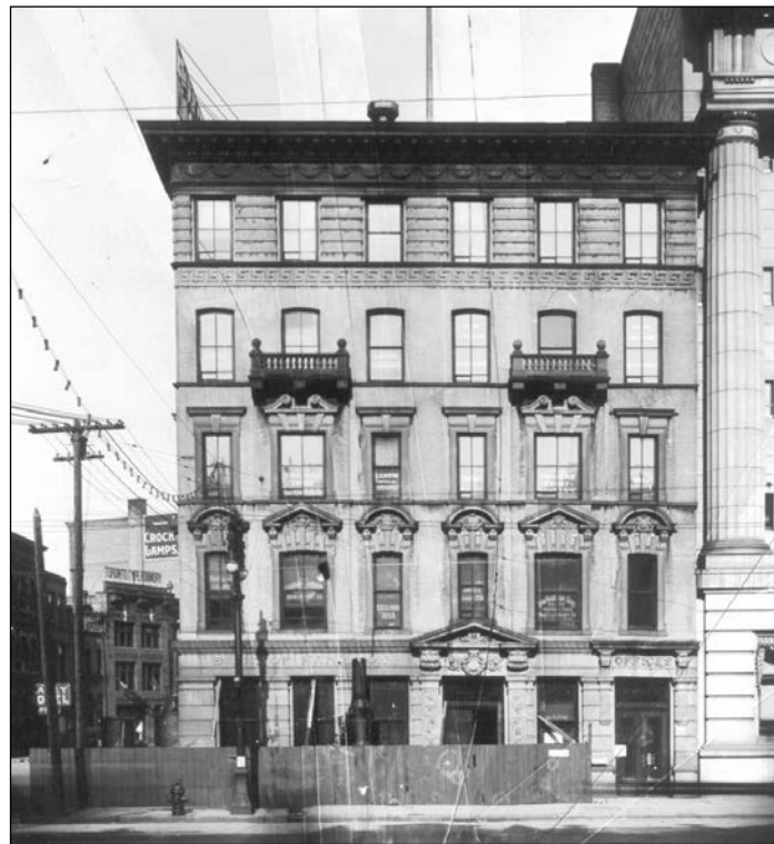
Plate 3 – Original Bank of Hamilton Building, Main Street, 1916.