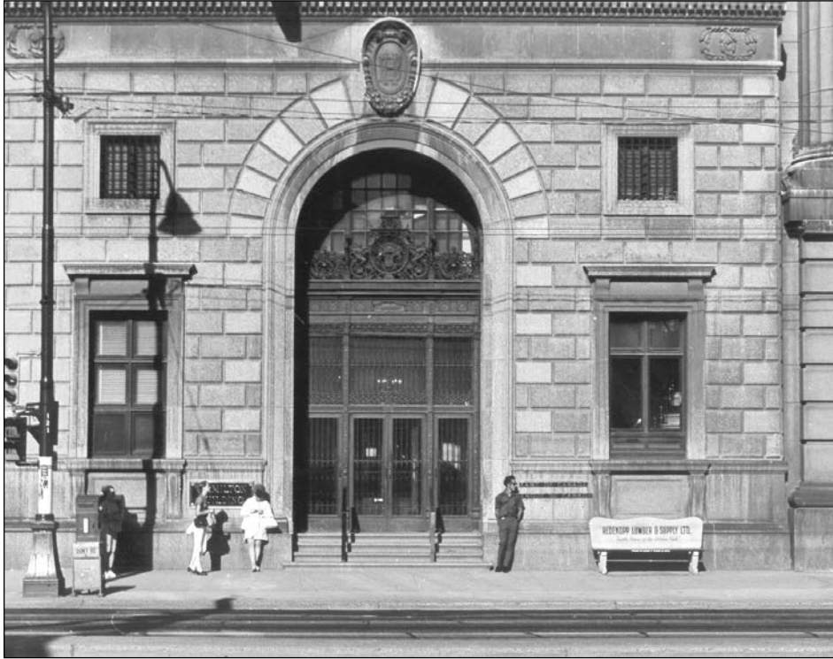
Plate 4 – Detail of main entrance 1969.