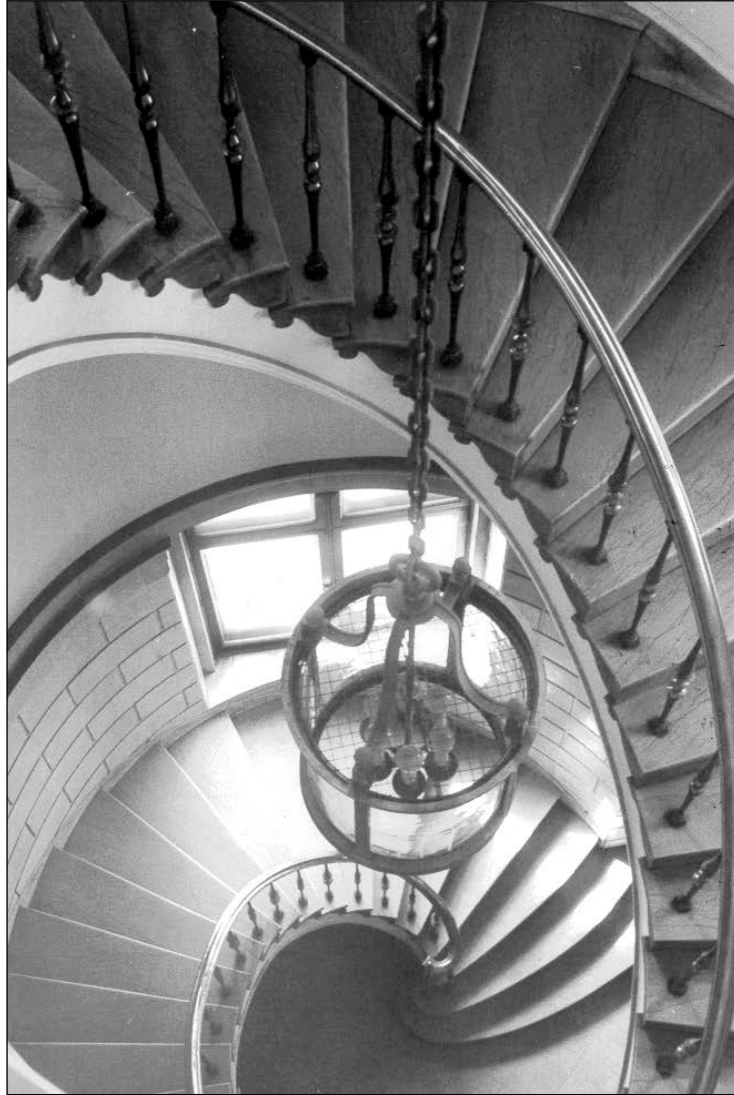
Plate 6 – Magnificent curved staircase, no date.