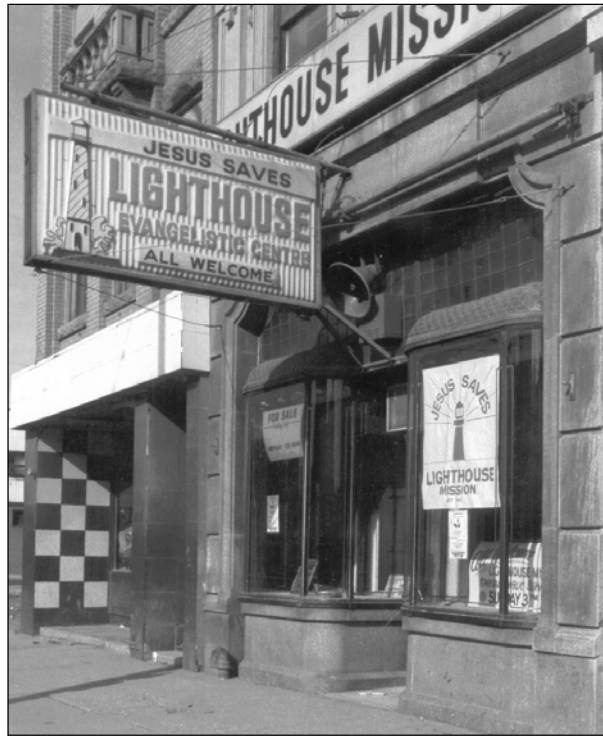
Plate 4 – Ground floor detailing, 1986. (City of Winnipeg, Planning Department.)