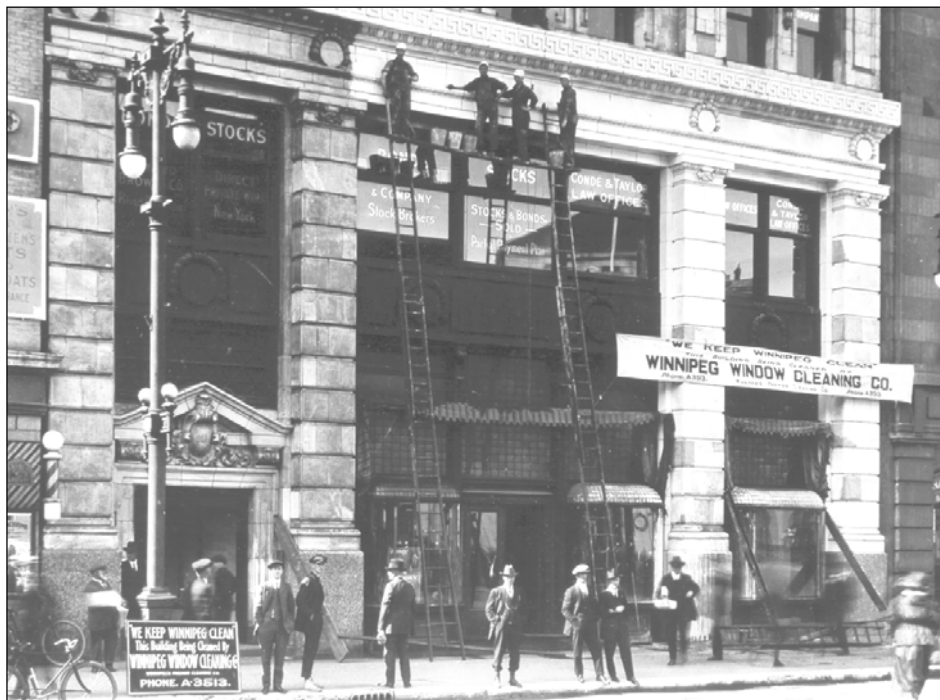
Plate 5 – The McArthur Building, corner Portage and Main, 1921. The ground level windows of this building are identical to the ones in the Zimmerman Block.