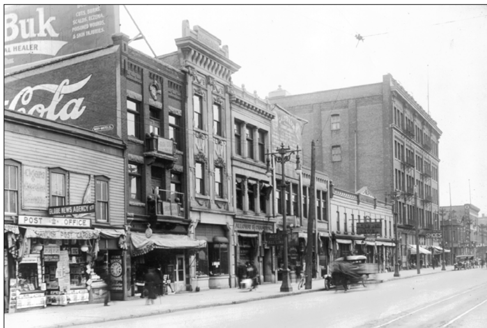
Plate 2 - The same buildings, 1918.