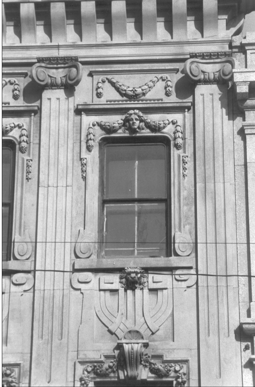
Plate 3 – Exterior window detailing, 1986.