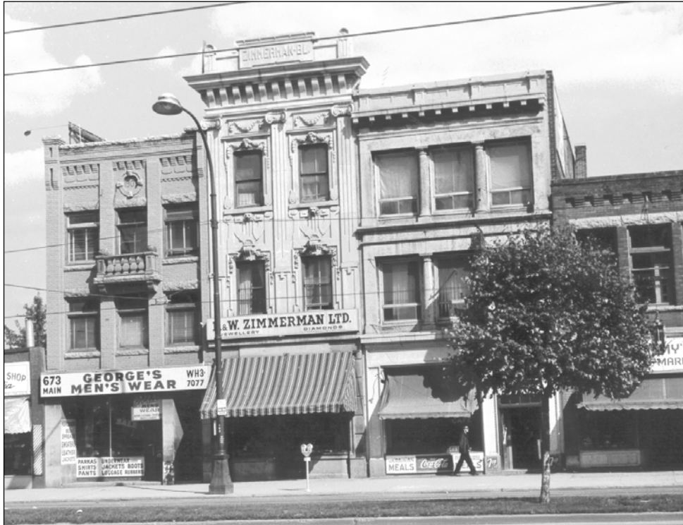
Plate 1 – 667-73 Main Street, 1969. The Zimmerman Block of 1913 (middle) is flanked by the 1903 Zimmerman Block on the left and the Alloway and Champion Bank on the right.