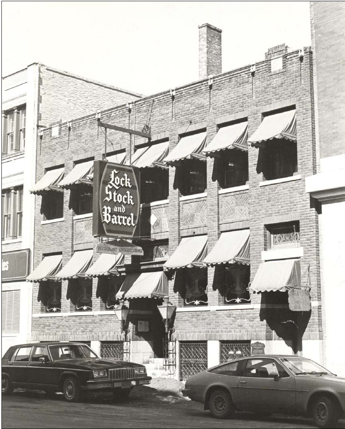
Plate 2 – Dawson Richardson Building renovated as the Lock, Stock and Barrel Restaurant, no date. (City of Winnipeg.)