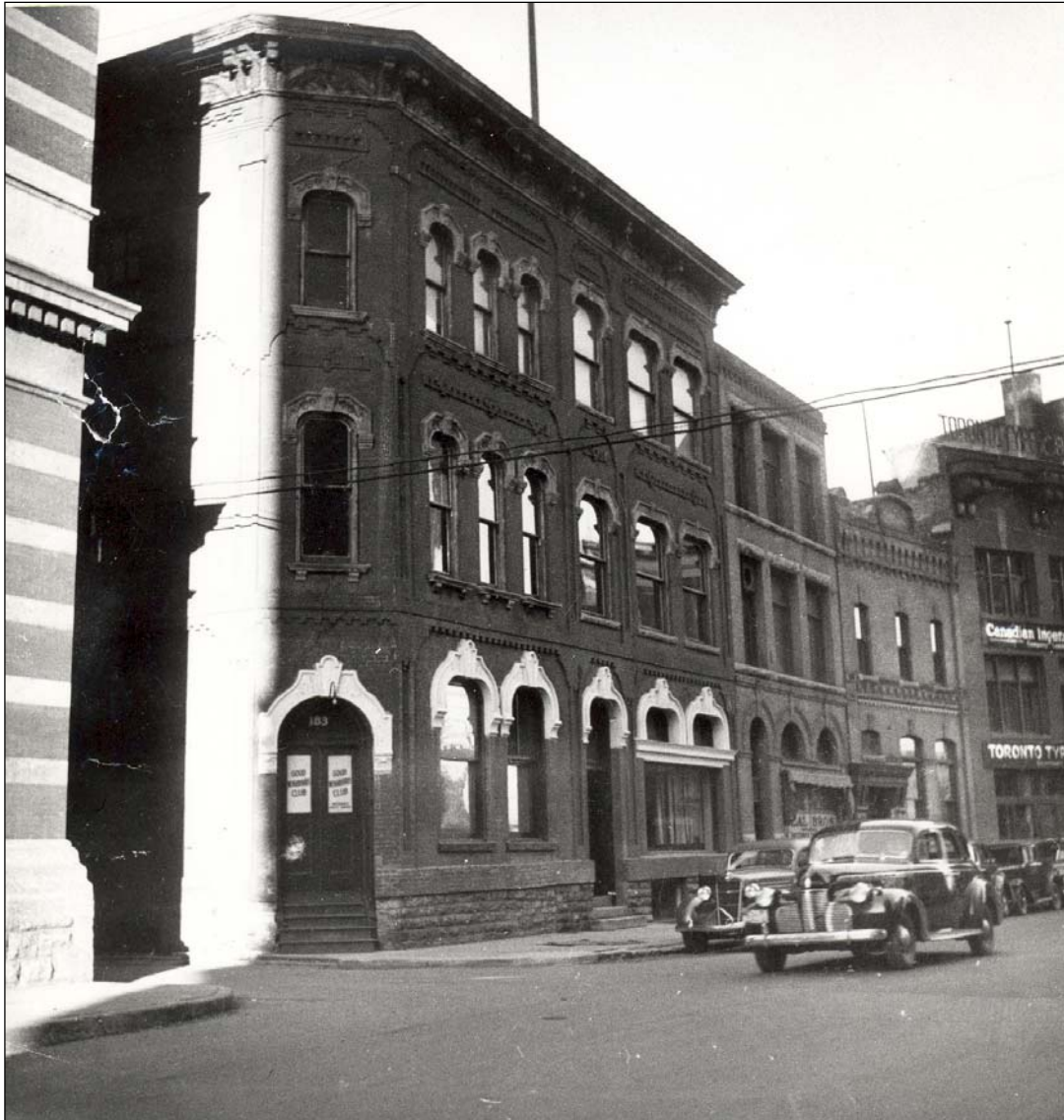
Plate 1 – North side of McDermot Avenue looking east. The Dawson Richardson Building is just out of the shot to the right, ca.1945.