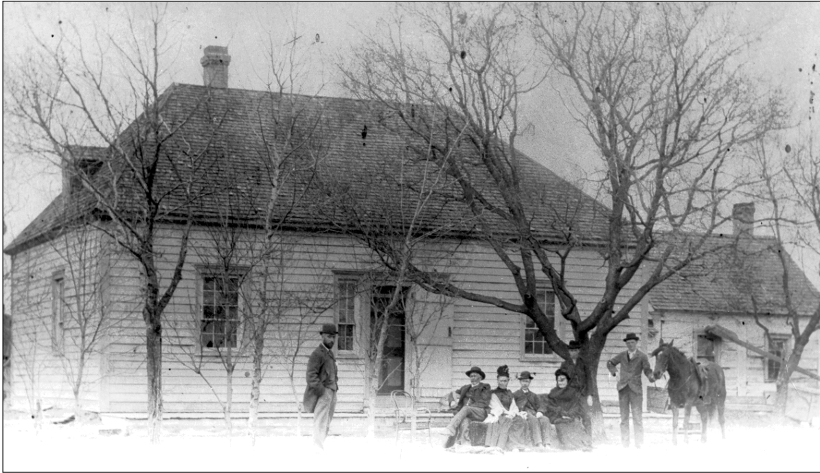
Plate 1 – William Ross House, ca.1890.