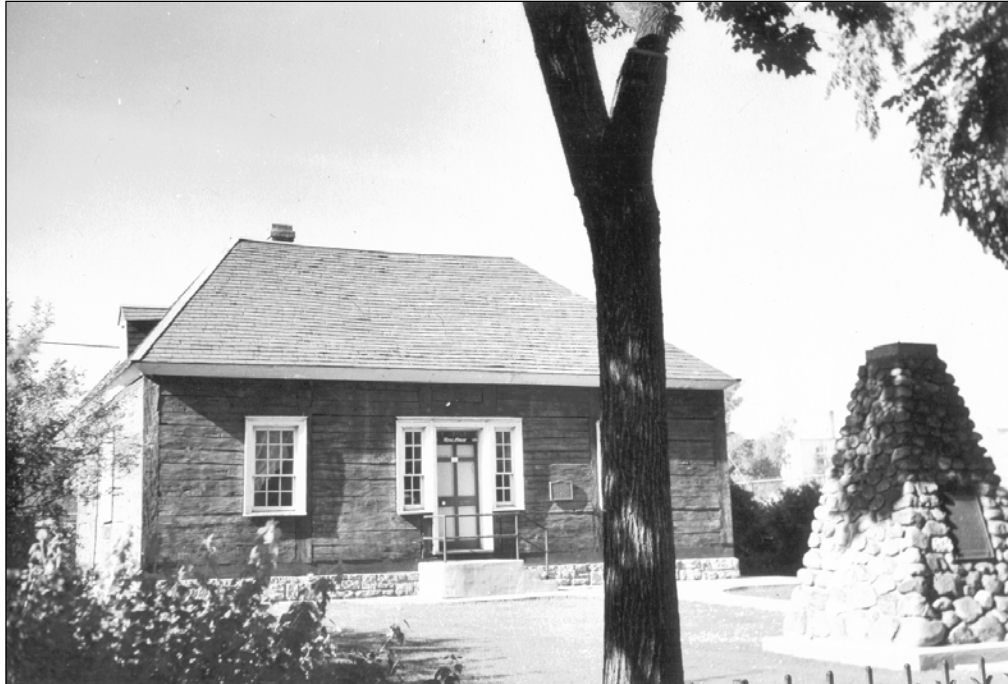
Plate 5 – William Ross House at Sir William Whyte Park, 1955.