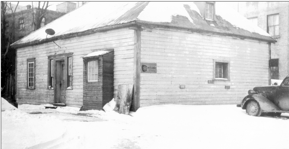
Plate 2 – William Ross House as the office for Midland Construction, Market Avenue, ca.1948.