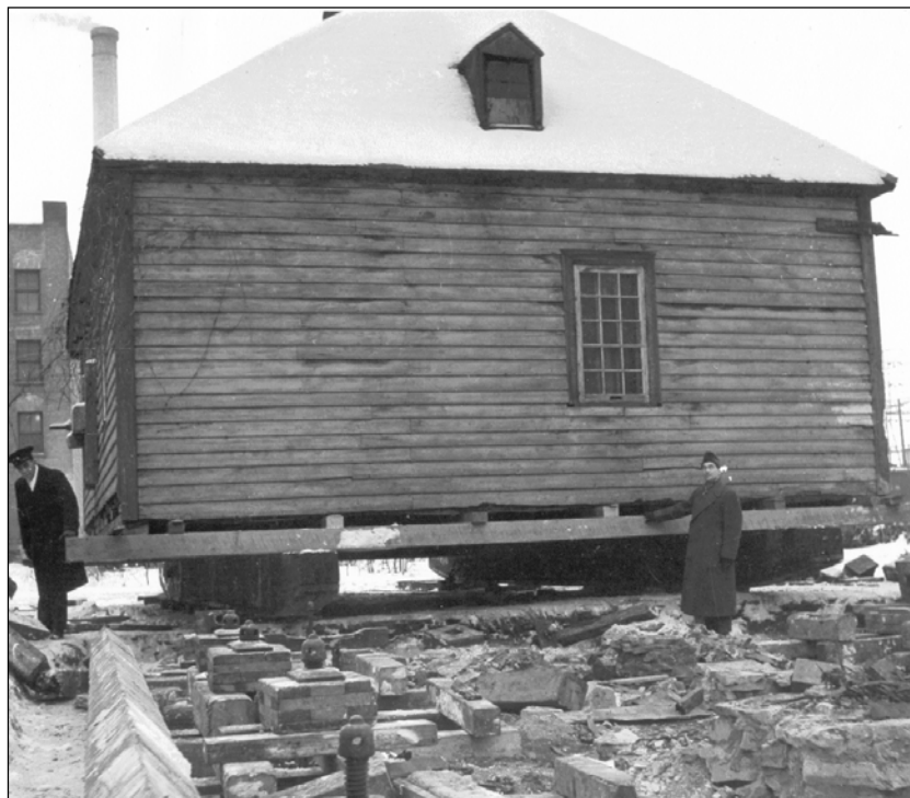
Plate 4 – Moving the house from the original site, 1948. W.L. Morton is on the right.