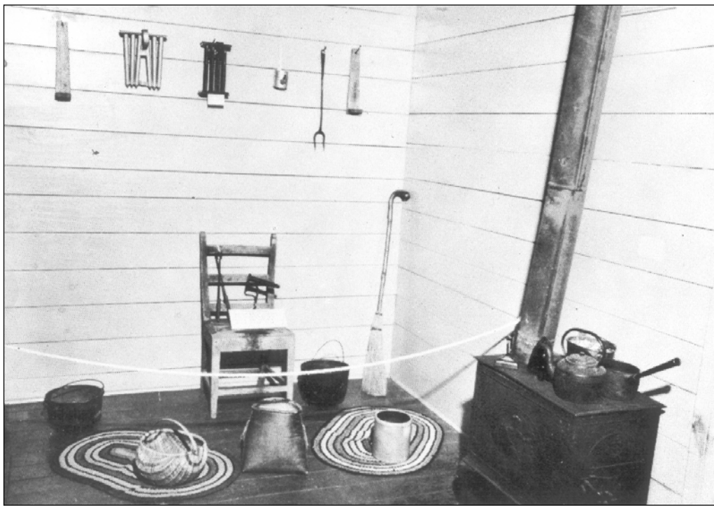
Plate 8 – Kitchen, as a museum, with the original carron stove, ca.1955.