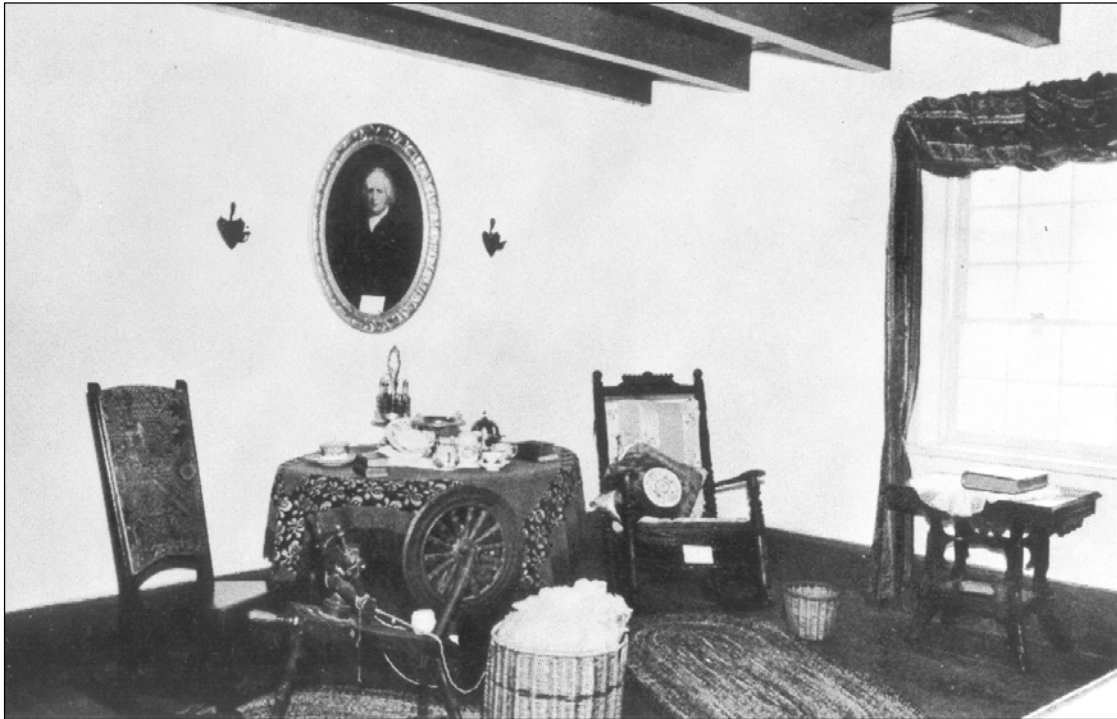
Plate 7 – Parlour, as a museum, ca.1955.