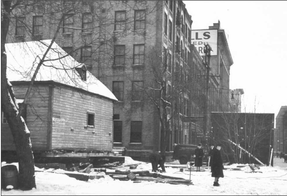
Plate 3 – Preparations being made to move the house from the foot of Market Avenue (where it was used as an office by Midland Construction) to Sir William Whyte Park, Higgins Avenue, 1948.