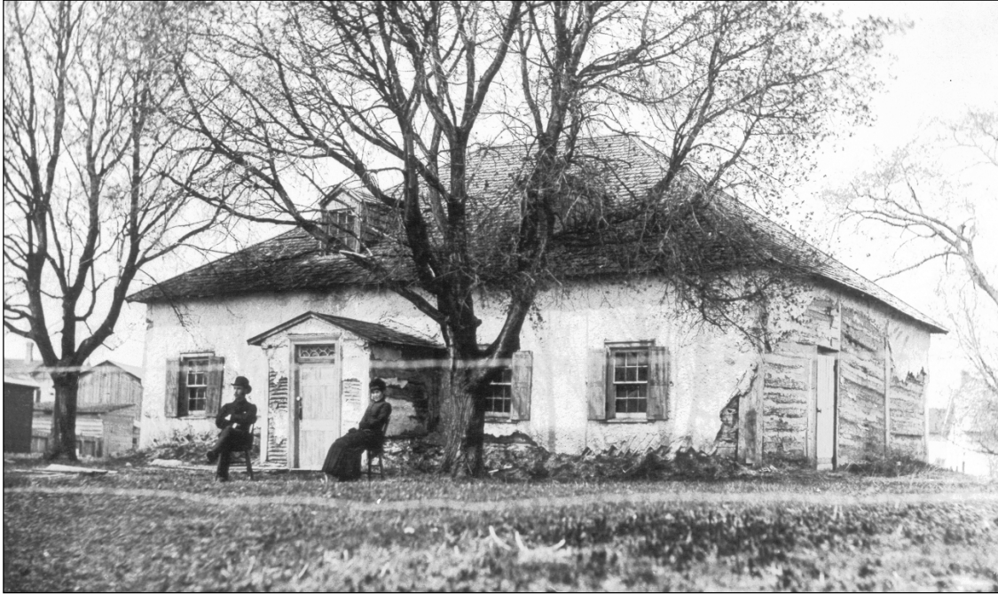
Plate 9 – “Colony Gardens,” no date.