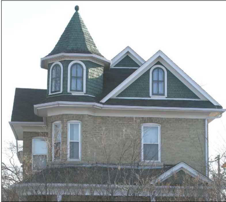
Front (north) façade detail, 2008

Windows throughout the house are unmatched and set in plain wooden frames. Ground and second-floor openings are round-headed with stone lug sills and radiating brick heads. The exception is the diamond-shaped window on the west side which lights the entrance foyer. The small windows in the gable ends and corner turret are arched and set in heavier wooden frames. The gable roof is multi-levelled and includes a cross gable on its eastern slope and ornamental shingles clad the gable ends.