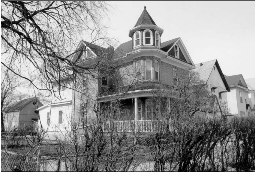
Front (north) and east façades, 1996