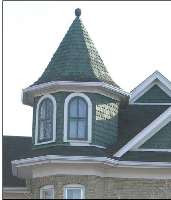
Northeast corner turret, 2008