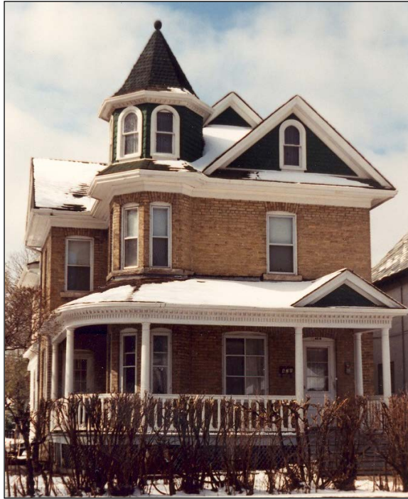
Front (north) and east façades, no date