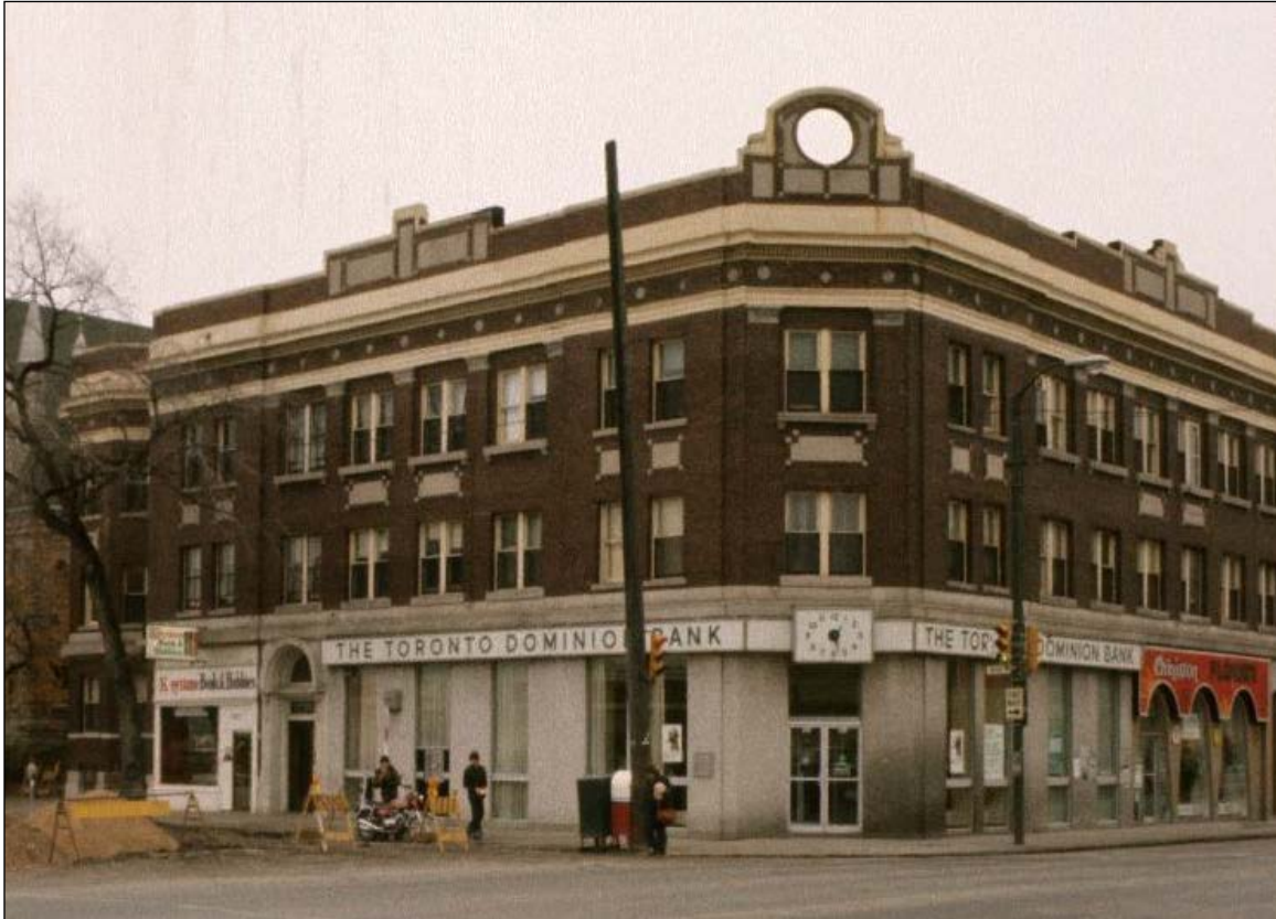
Plate 11 – Osborne-River Building, 100 Osborne Street, ca.1970. Note the stone cladding on the ground floor on both main façades.