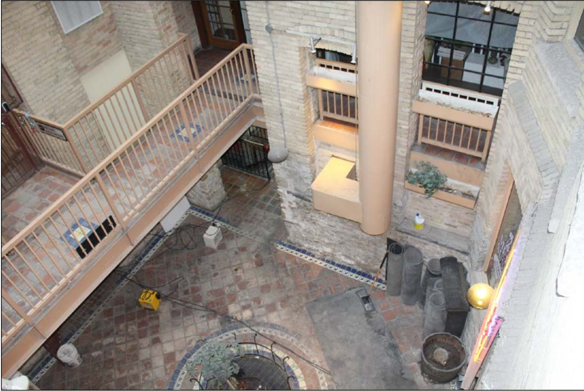
Plate 16 – Osborne-River Building, 100 Osborne Street, interior bridge and basement retail area from second floor, 2019. (M. Peterson, 2019.)