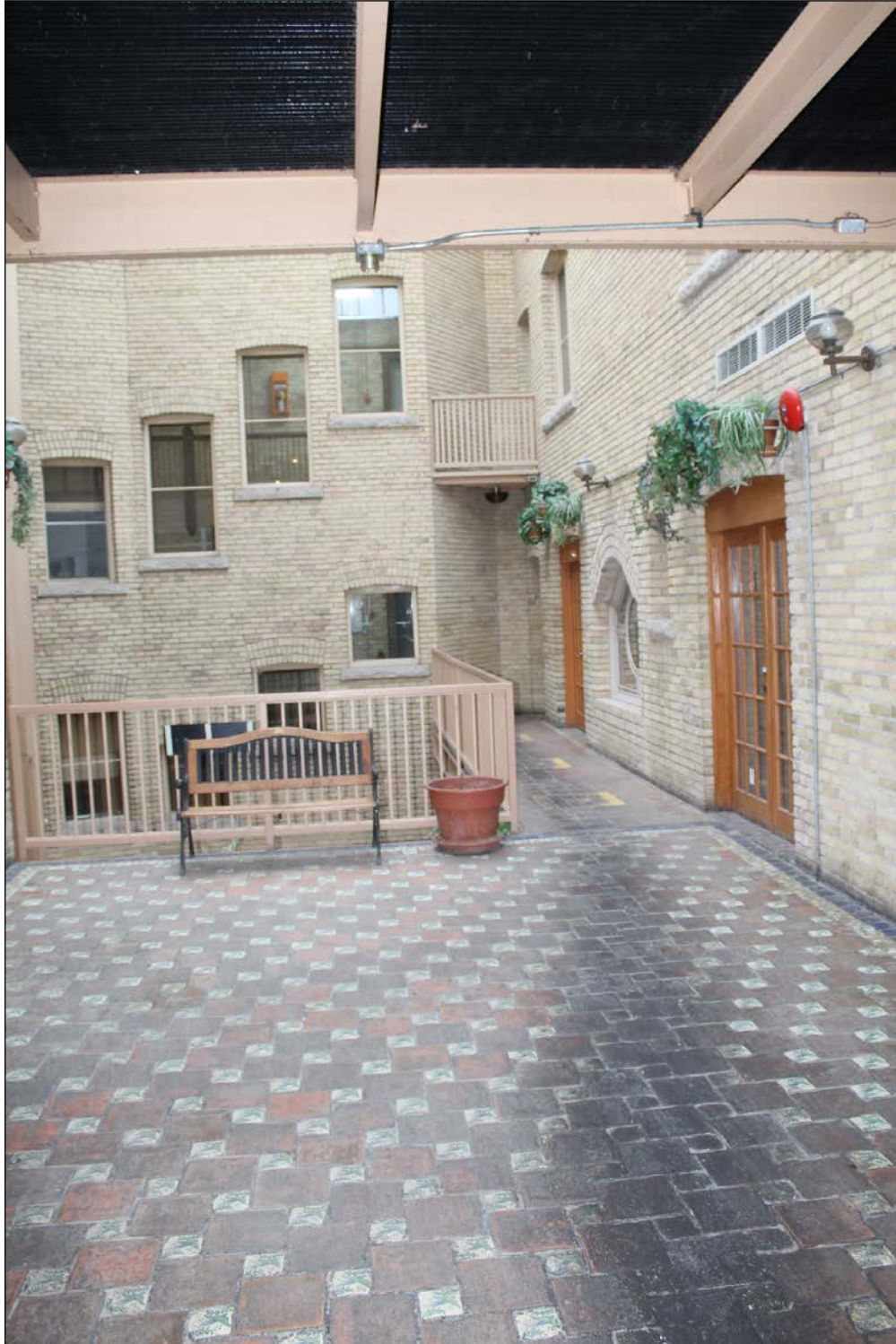
Plate 18 – Osborne-River Building, 100 Osborne Street, 2 nd floor, 2019.