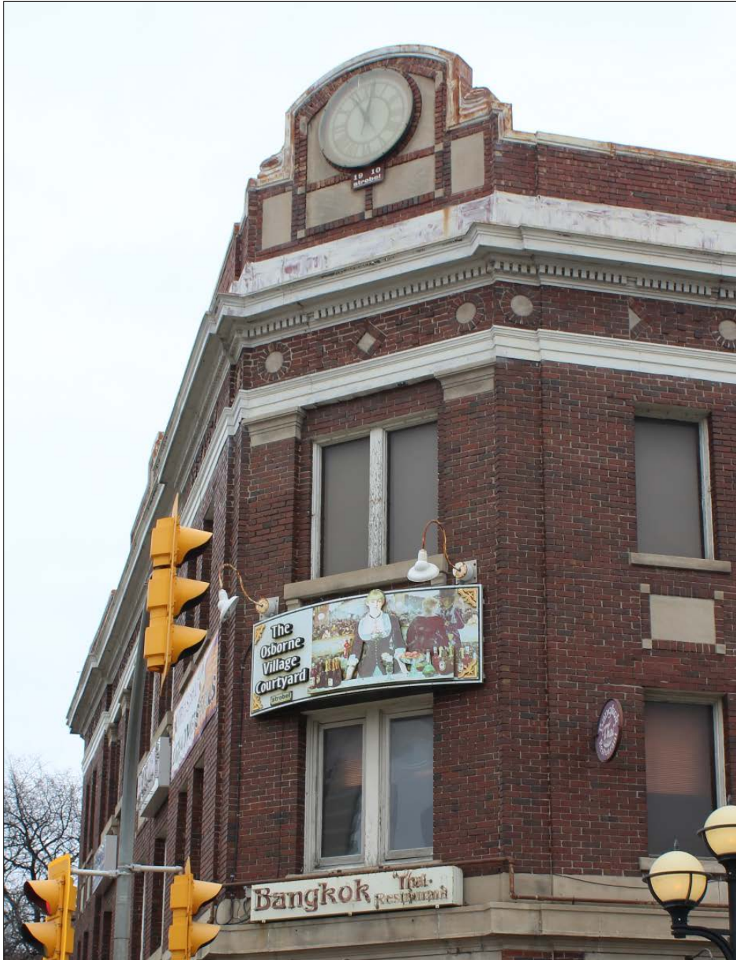
Plate 8 – Osborne-River Building, 100 Osborne Street, clock, 2019. (M. Peterson, 2019.)