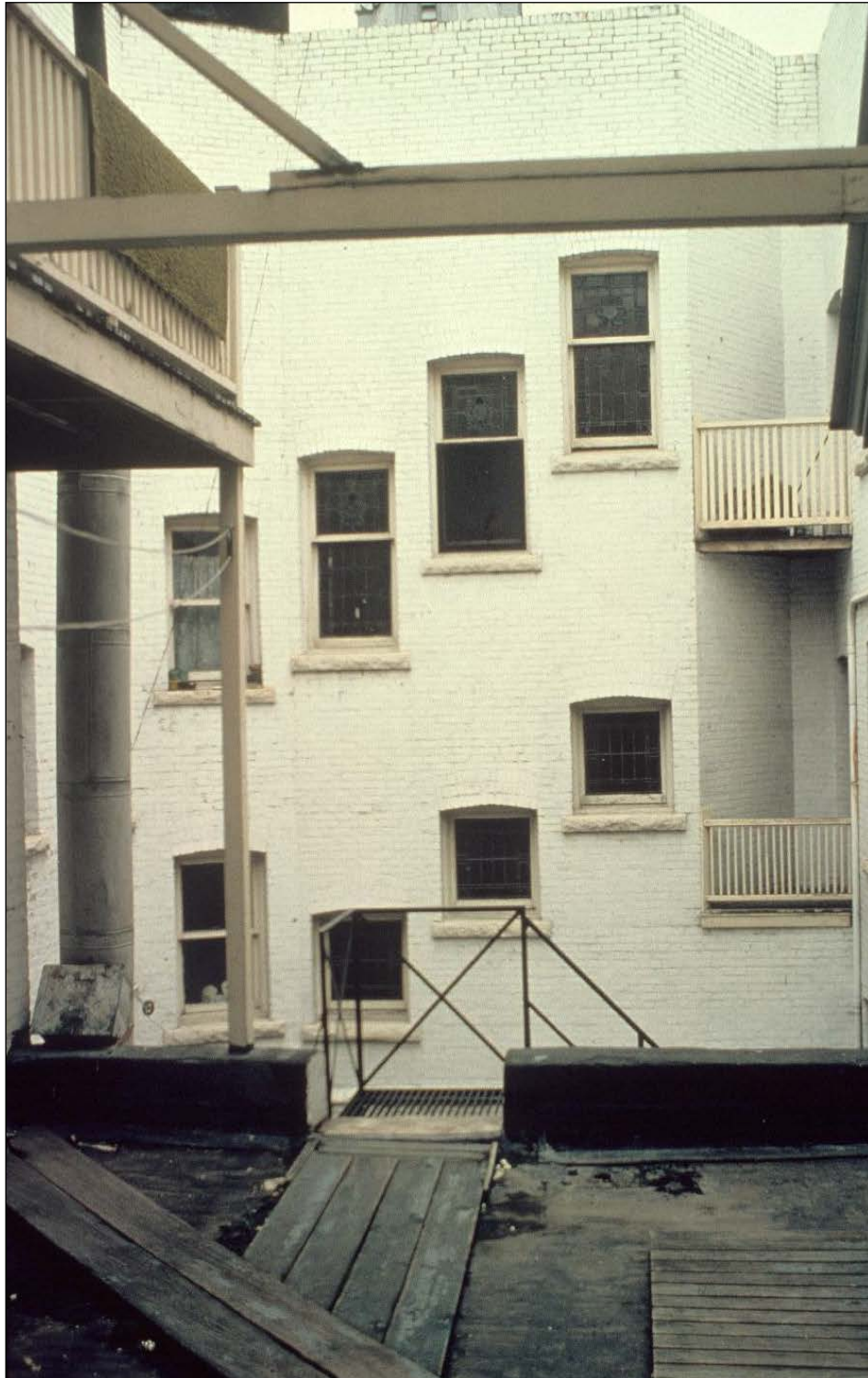
Plate 15 – Osborne-River Building, 100 Osborne Street, interior courtyard, ca.1970.