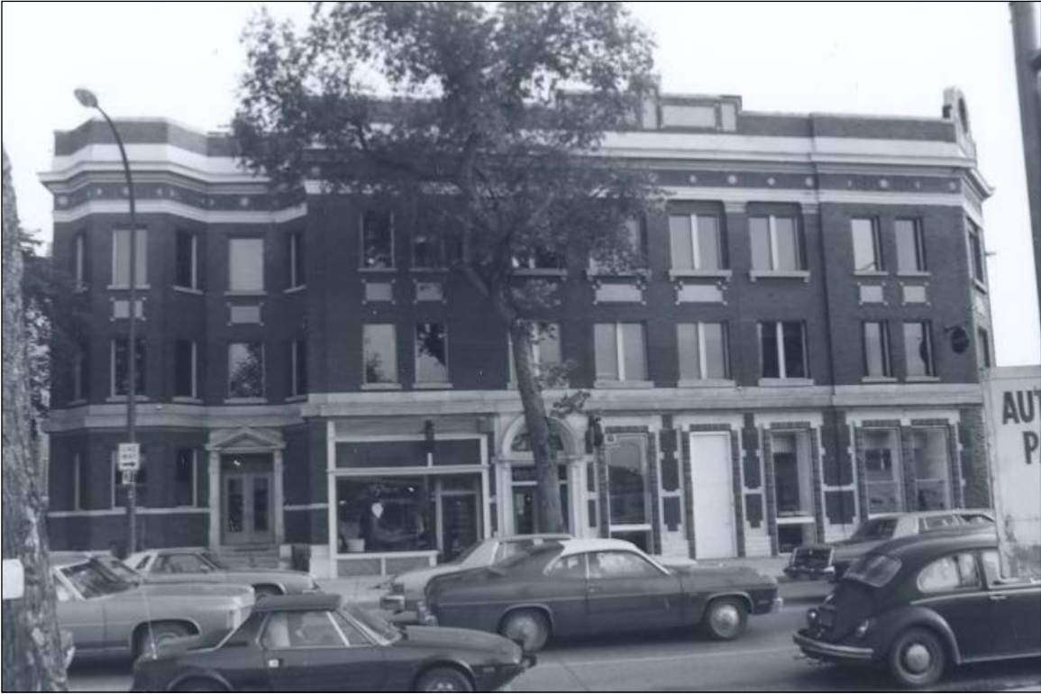
Plate 12 – Osborne-River Building, 100 Osborne Street, 1978.