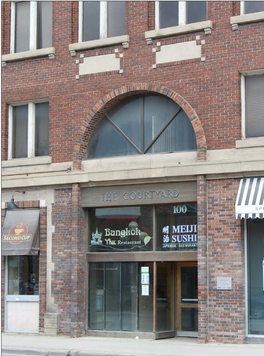
Plate 6 – Osborne-River Building, 100 Osborne Street, Osborne Street entrance, 2016.