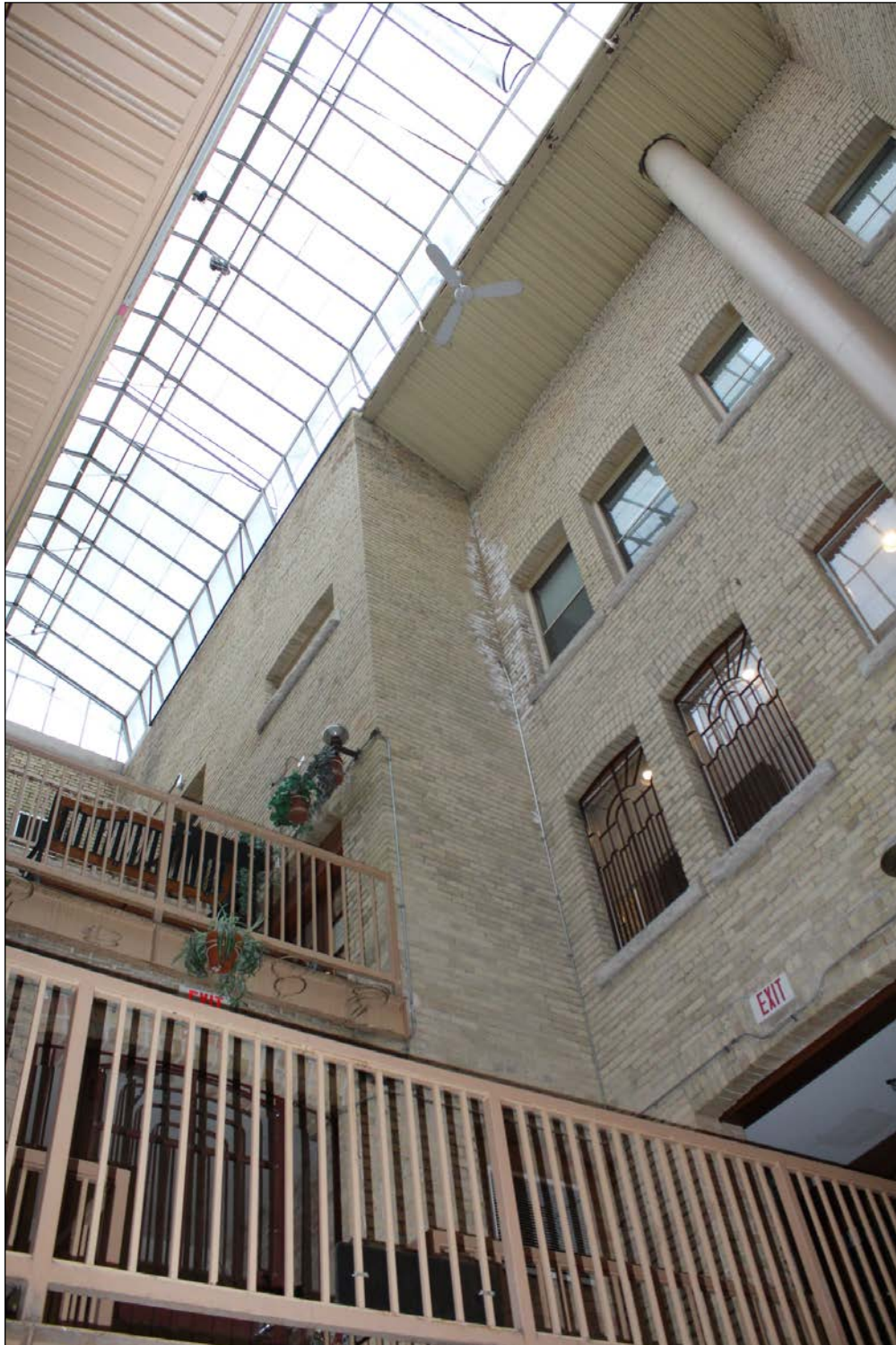
Plate 17 – Osborne-River Building, 100 Osborne Street, glass roof, 2019. (M. Peterson, 2019.)