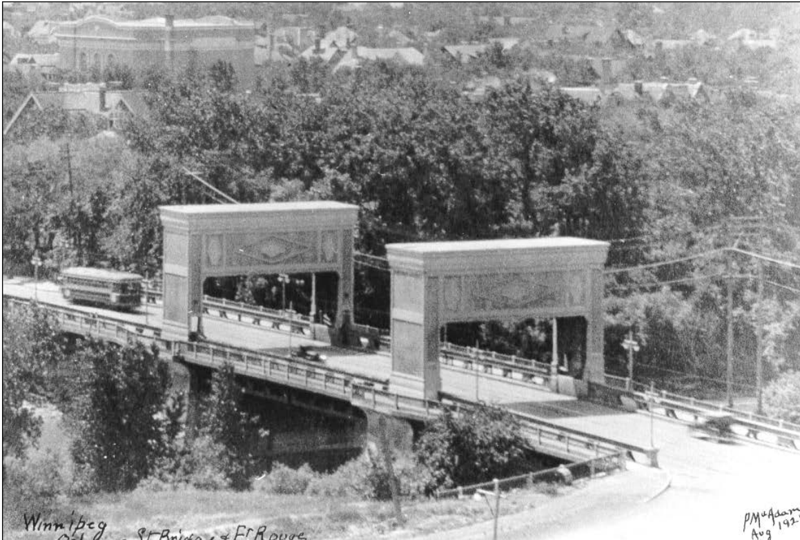
Plate 1 – The second Osborne Street Bridge with its unique superstructure, 1924.