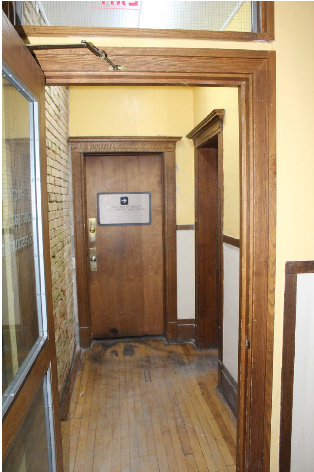
Plate 19 – Osborne-River Building, 100 Osborne Street, 2 nd floor hallway, 2019. (M. Peterson, 2019.)