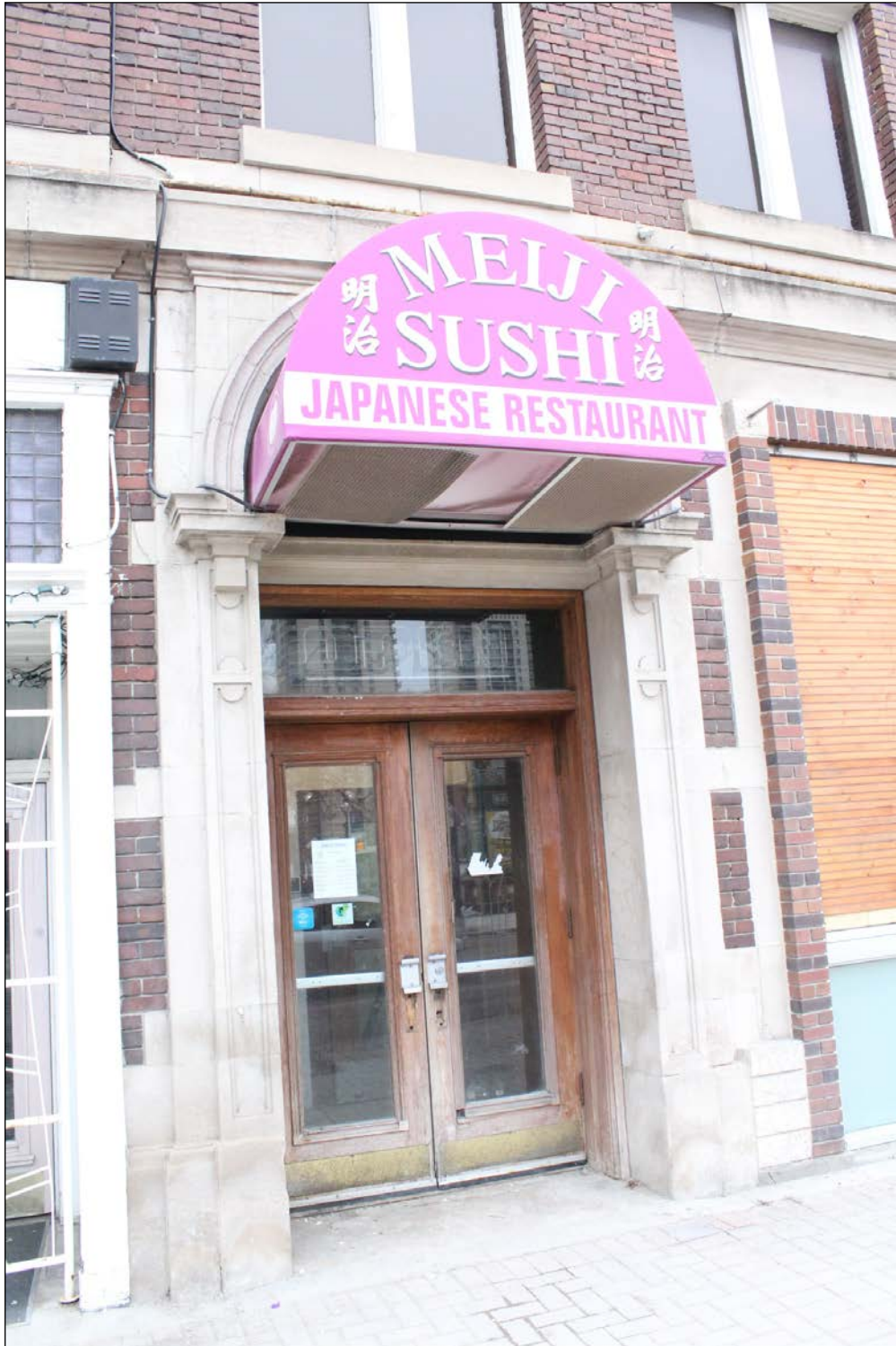
Plate 5 – Osborne-River Building, 100 Osborne Street, River Avenue entrance, 2019. ( M. Peterson, 2019. )