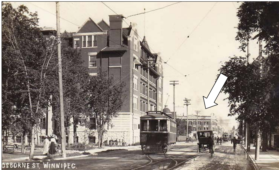
Plate 21 – Osborne Street looking south from the Osborne Bridge, no date. Osborne-River block in background (arrow).