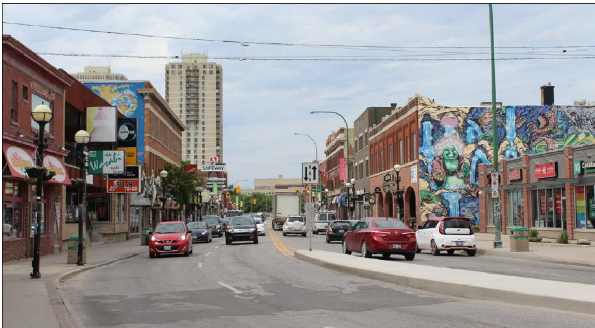
Plate 23 – River Avenue, looking north from Stradbrook Avenue, 2016.