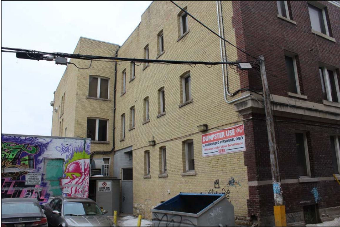
Plate 10 – Osborne-River Building, 100 Osborne Street, south façade, 2019.