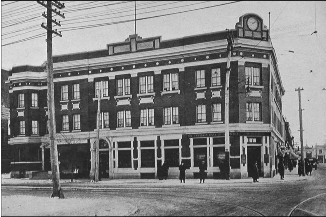
Plate 3 – Osborne-River Building, 100 Osborne Street, shortly after opening, 1912. ( City of Winnipeg. )