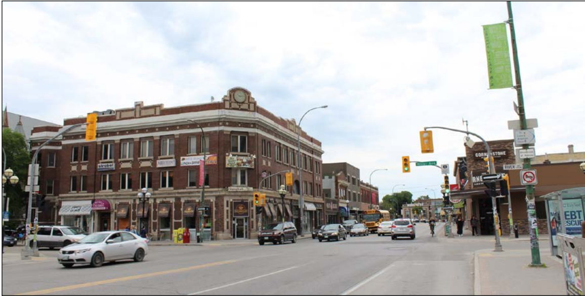
Plate 22 – Osborne Street, looking south from River Avenue, 2016.