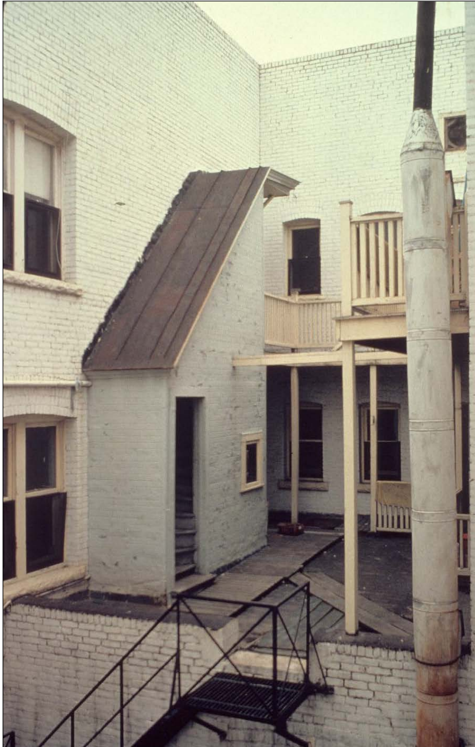
Plate 14 – Osborne-River Building, 100 Osborne Street, interior courtyard, ca.1970.