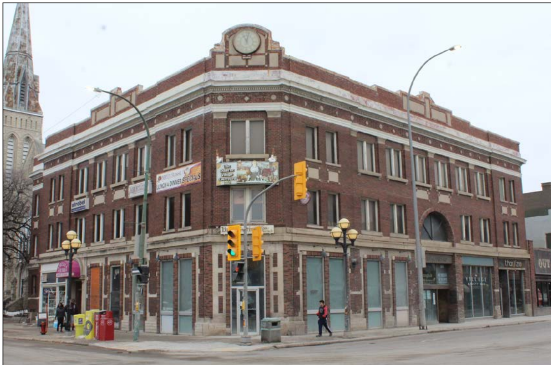
Plate 4 – Osborne-River Building, 100 Osborne Street, north and west façades, 2019.