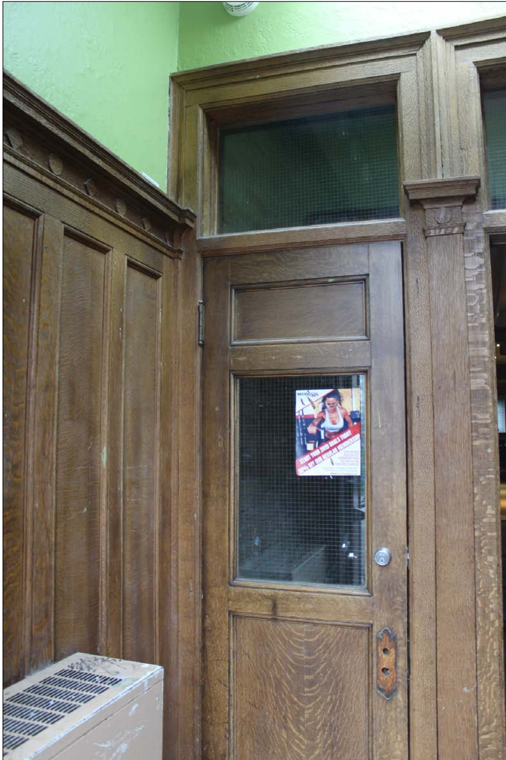
Plate 20 – Osborne-River Building, 100 Osborne Street, northeast corner entrance foyer, 2019.