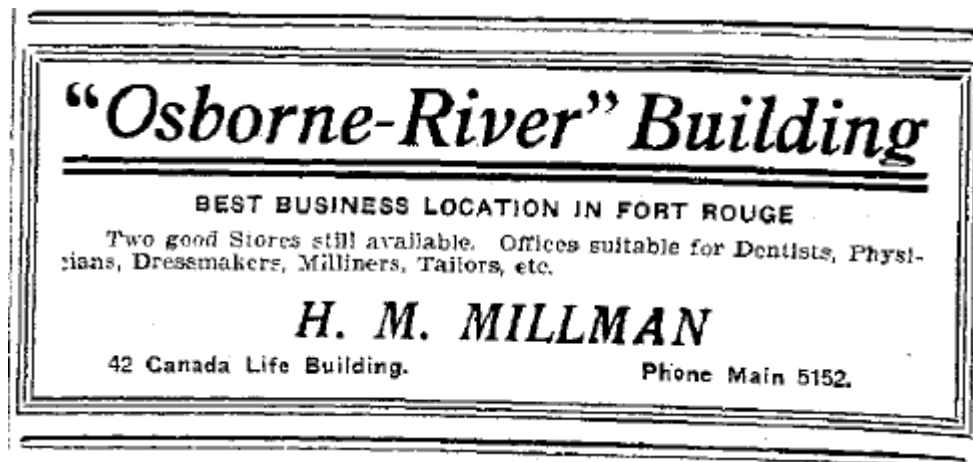
Plate 2 – Advertisement for the new Osborne-River Building, 1910.