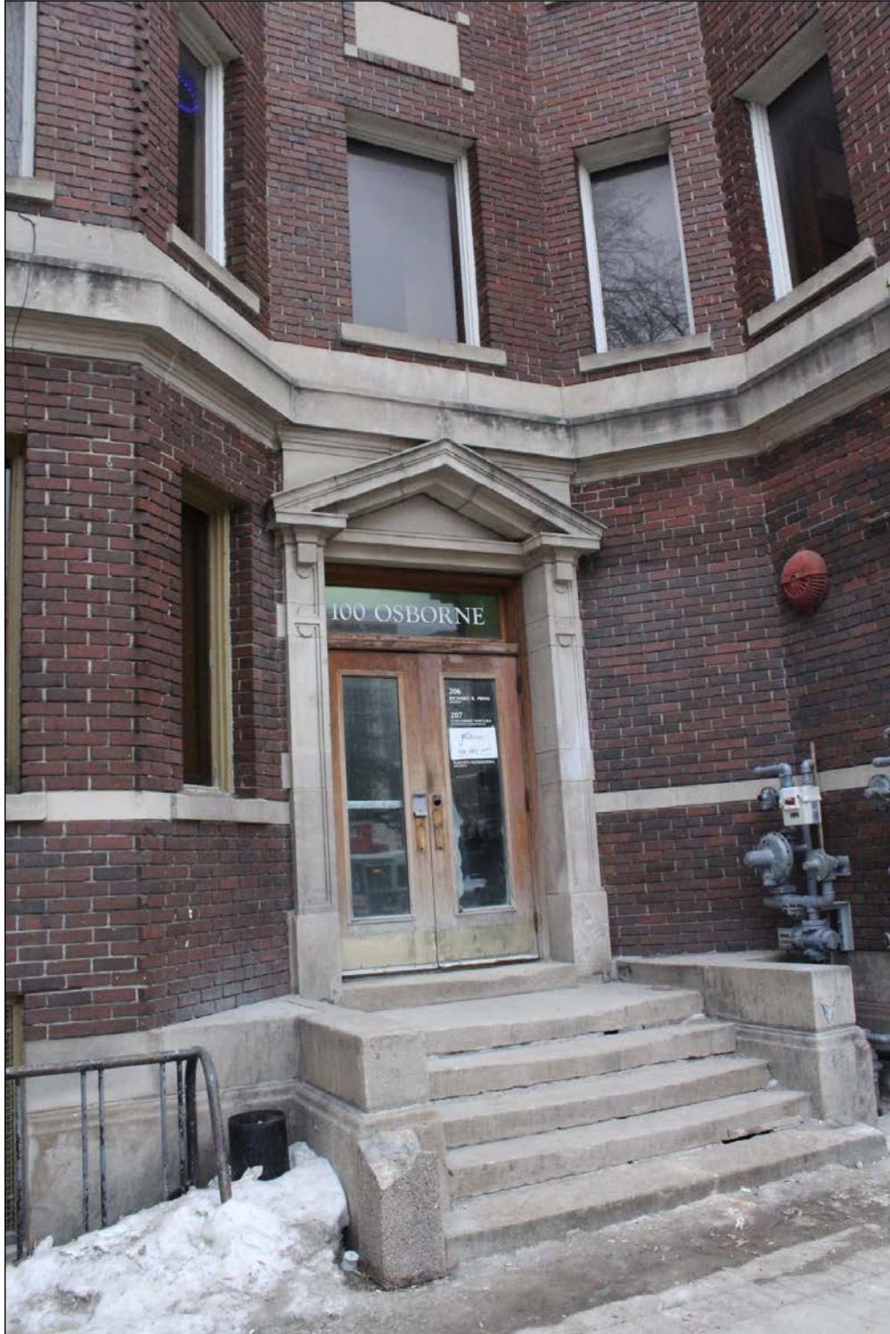
Plate 7 – Osborne-River Building, 100 Osborne Street, northeast corner entrance, 2019. ( M. Peterson, 2019. )