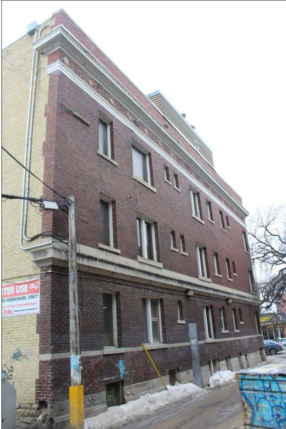
Plate 9 – Osborne-River Building, 100 Osborne Street, east façade, 2019. (M. Peterson, 2019.)