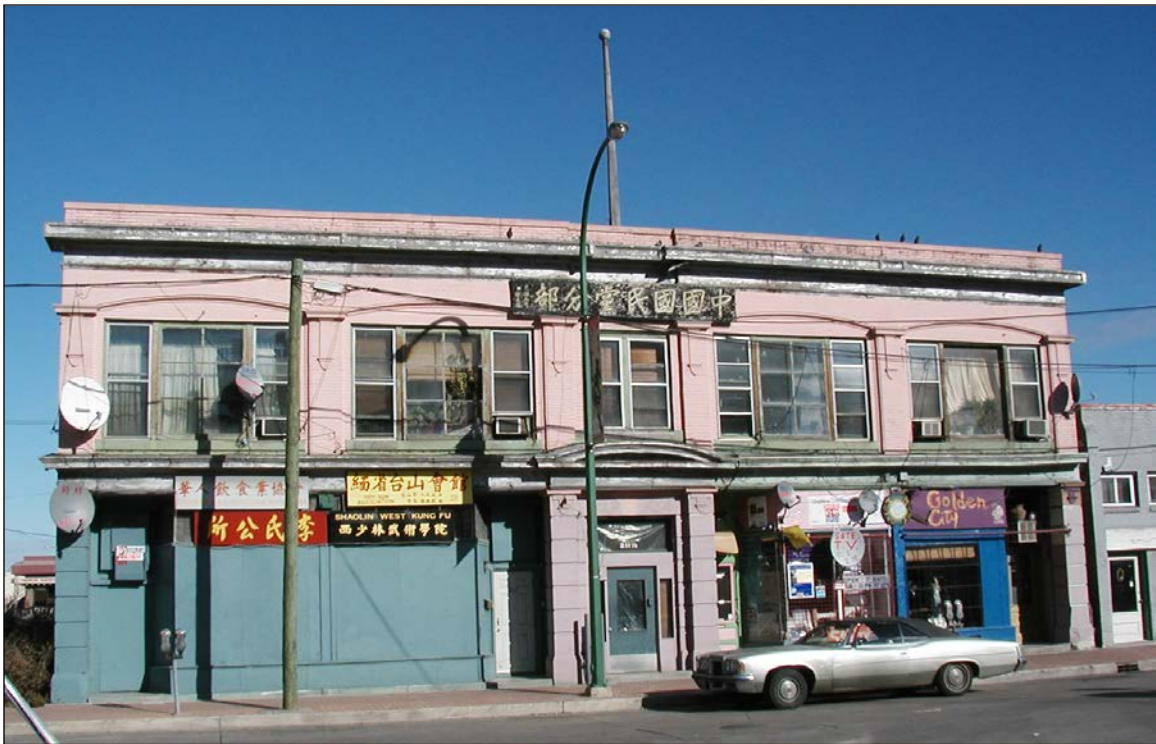
Plate 11 – Johnstone Block (Kuo Min Tang Building), 209-215 Pacific Avenue, 2002. ( M. Peterson, 2002. )