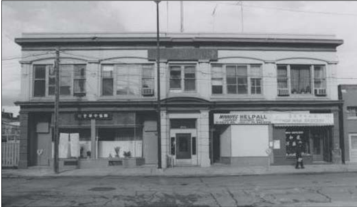
Plate 10 – Johnstone Block (Kuo Min Tang Building), 209-215 Pacific Avenue, ca.1979.