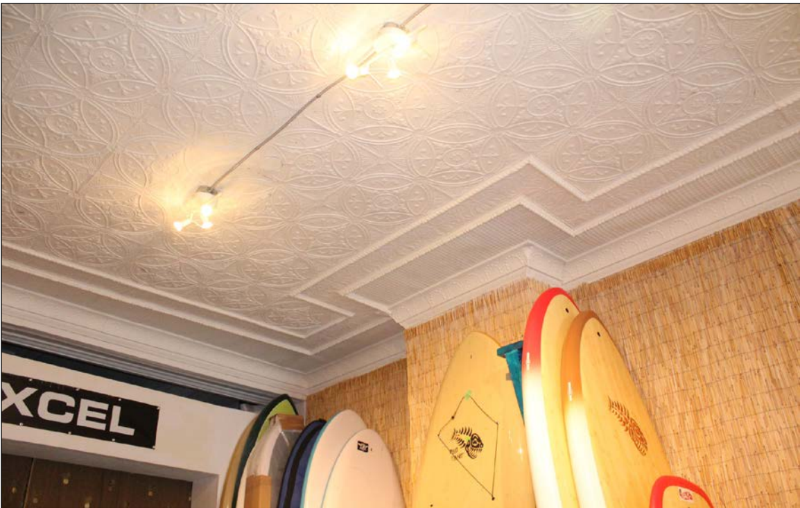
Plate 18 – Johnstone Block (Kuo Min Tang Building), 209 Pacific Avenue, tin ceiling, #209 Pacific Avenue,, 2019.