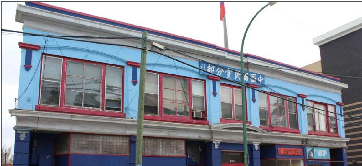
Plate 8 – Johnstone Block (Kuo Min Tang Building), 209 Pacific Avenue, detail of front (south) façade, 2019.