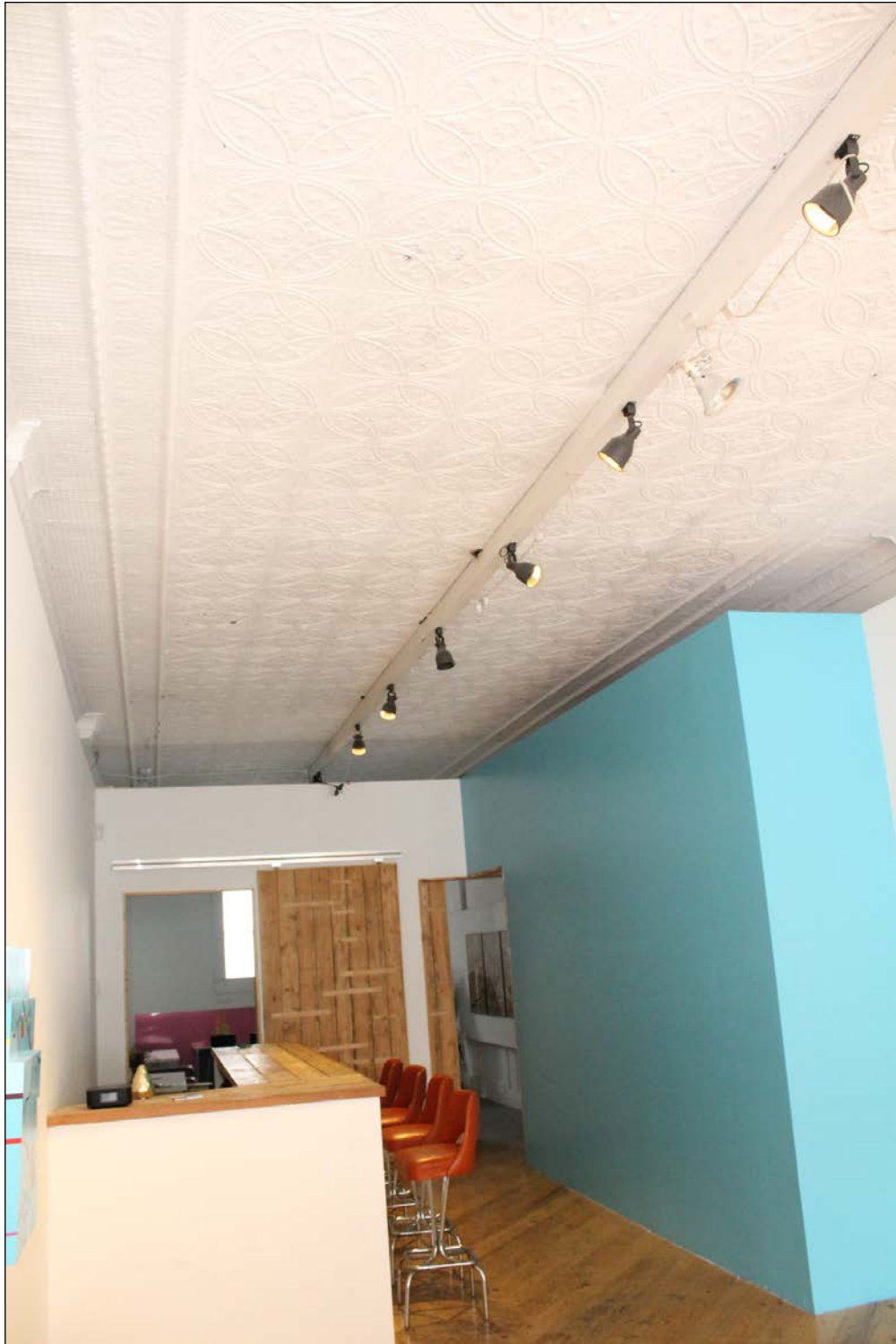
Plate 16 – Johnstone Block (Kuo Min Tang Building), 209 Pacific Avenue, tin ceiling, #211 Pacific Avenue, 2019. (M. Peterson, 2019.)