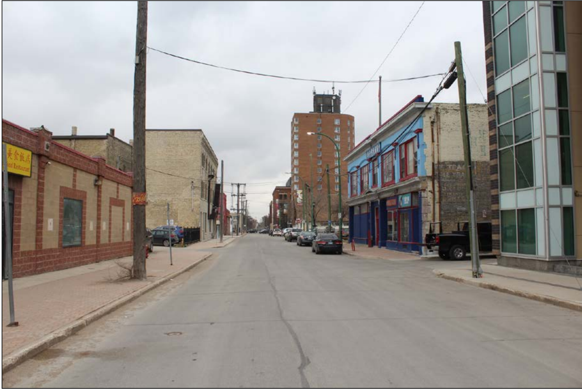
Plate 19 – Pacific Avenue looking west from Main Street, 2019. (M. Peterson, 2019.)