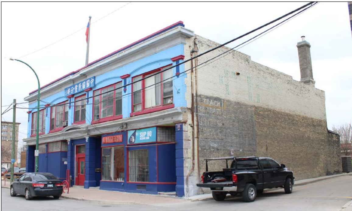
Plate 13 – Johnstone Block (Kuo Min Tang Building), 209 Pacific Avenue, front (south) and east façade, 2019. (M. Peterson, 2019.)