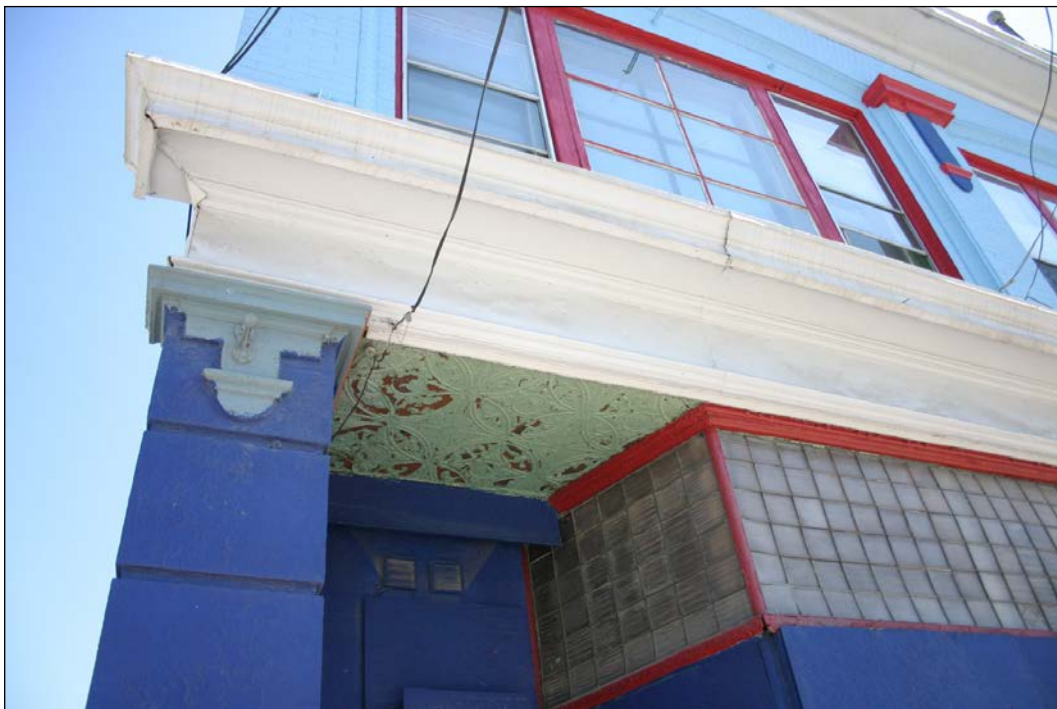
Plate 5 – Johnstone Block (Kuo Min Tang Building), 209 Pacific Avenue, west end of front façade, 2019.