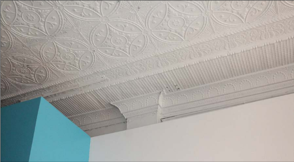
Plate 17 – Johnstone Block (Kuo Min Tang Building), 209 Pacific Avenue, tin ceiling, #211 Pacific Avenue, 2019.