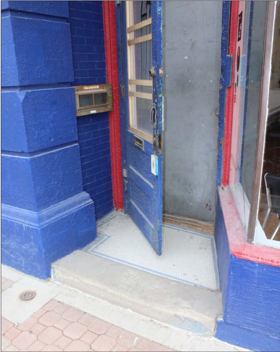
Plate 6 – Johnstone Block (Kuo Min Tang Building), 209 Pacific Avenue, tile flooring in recessed entrance to #211, 2019.