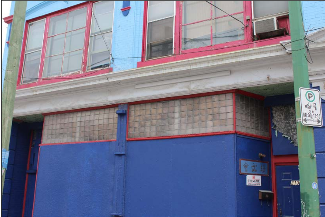
Plate 4 – Johnstone Block (Kuo Min Tang Building), 209 Pacific Avenue, west end of front (south) façade, 2019. (M. Peterson, 2019.)