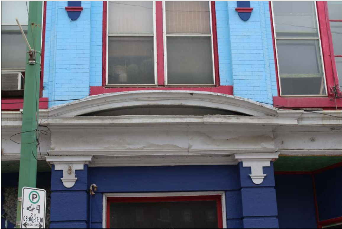
Plate 7 – Johnstone Block (Kuo Min Tang Building), 209 Pacific Avenue, detail of front (south) entrance, 2019. (M. Peterson, 2019.)