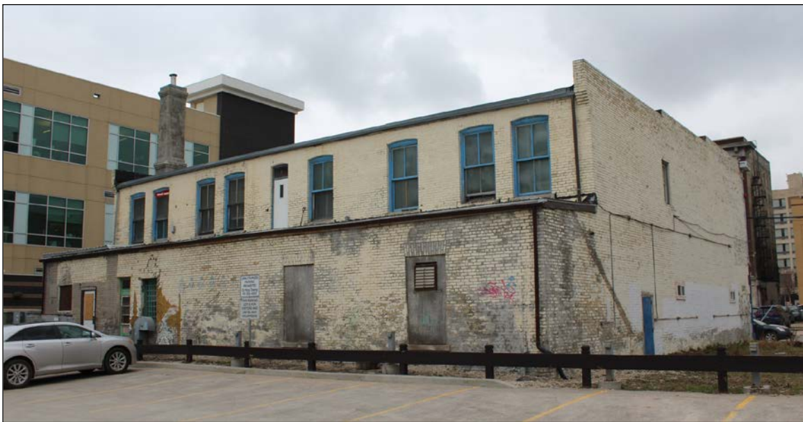
Plate 2 – Johnstone Block (Kuo Min Tang Building), 209 Pacific Avenue, rear (north) and west façades, 2019.