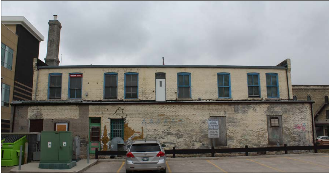
Plate 12 – Johnstone Block (Kuo Min Tang Building), 209 Pacific Avenue, rear (north) façade, 2019.