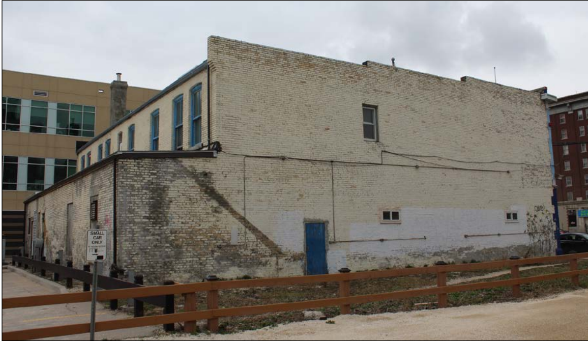
Plate 14 – Johnstone Block (Kuo Min Tang Building), 209 Pacific Avenue, rear (north) and west façades, 2019.