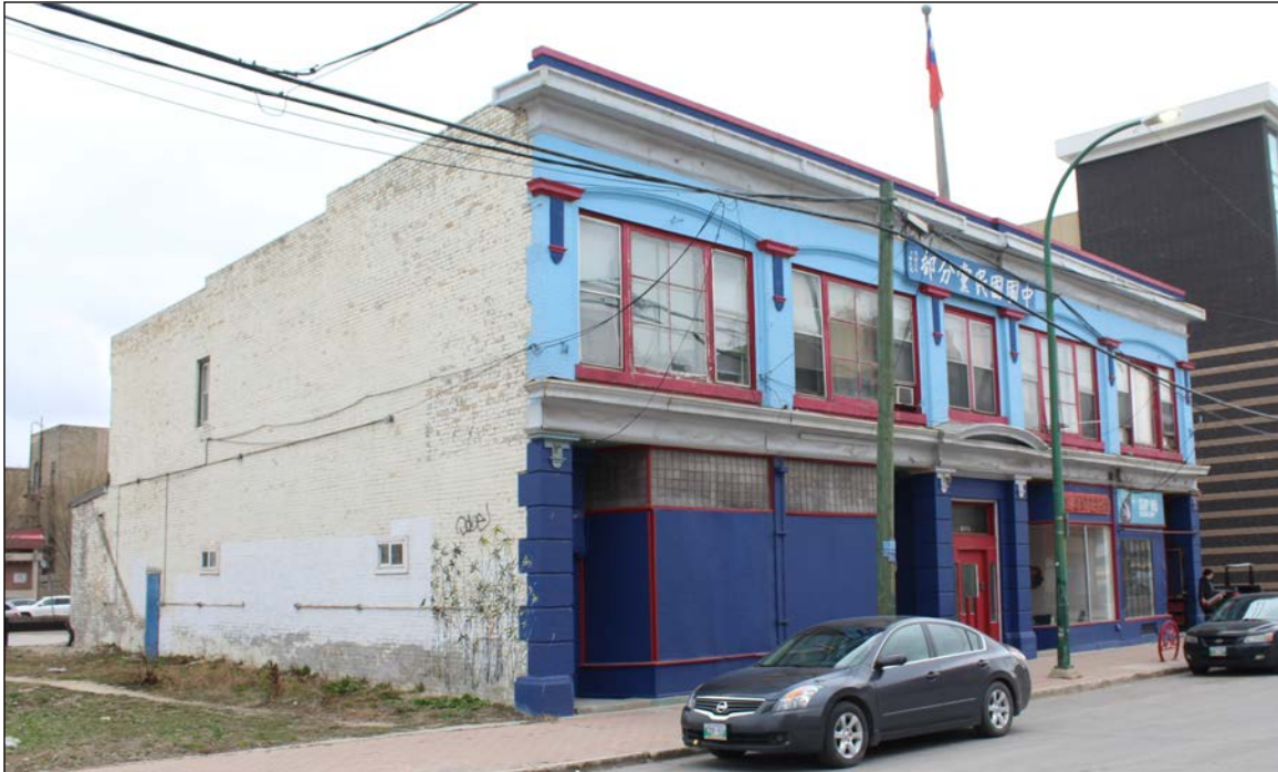
Plate 1 – Johnstone Block (Kuo Min Tang Building), 209 Pacific Avenue, front (south) and west façades, 2019. ( M. Peterson, 2019. )