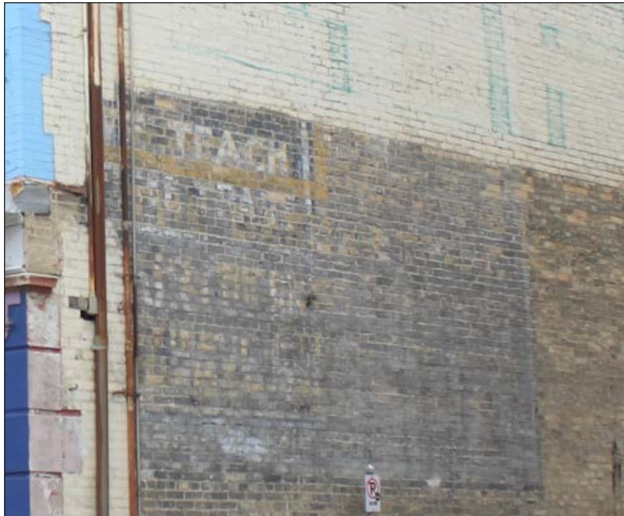
Plate 15 – Johnstone Block (Kuo Min Tang Building), 209 Pacific Avenue, painted signage on the east façade, 2019. (M. Peterson, 2019.)