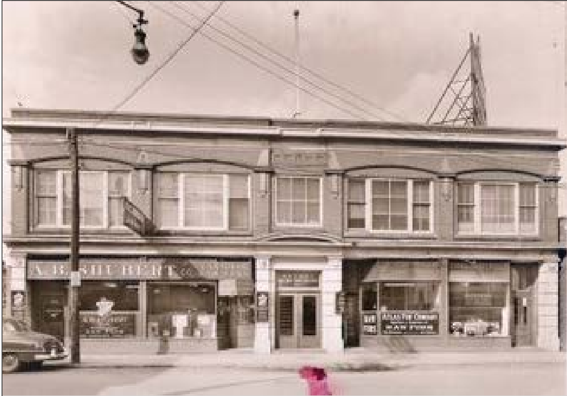
Plate 9 – Johnstone Block, 209-215 Pacific Avenue, front (south) and west façades, ca.1950. (Reproduced from riseandsprawl.blogspot.com , “Building weaker communities”, January 14, 2009.)