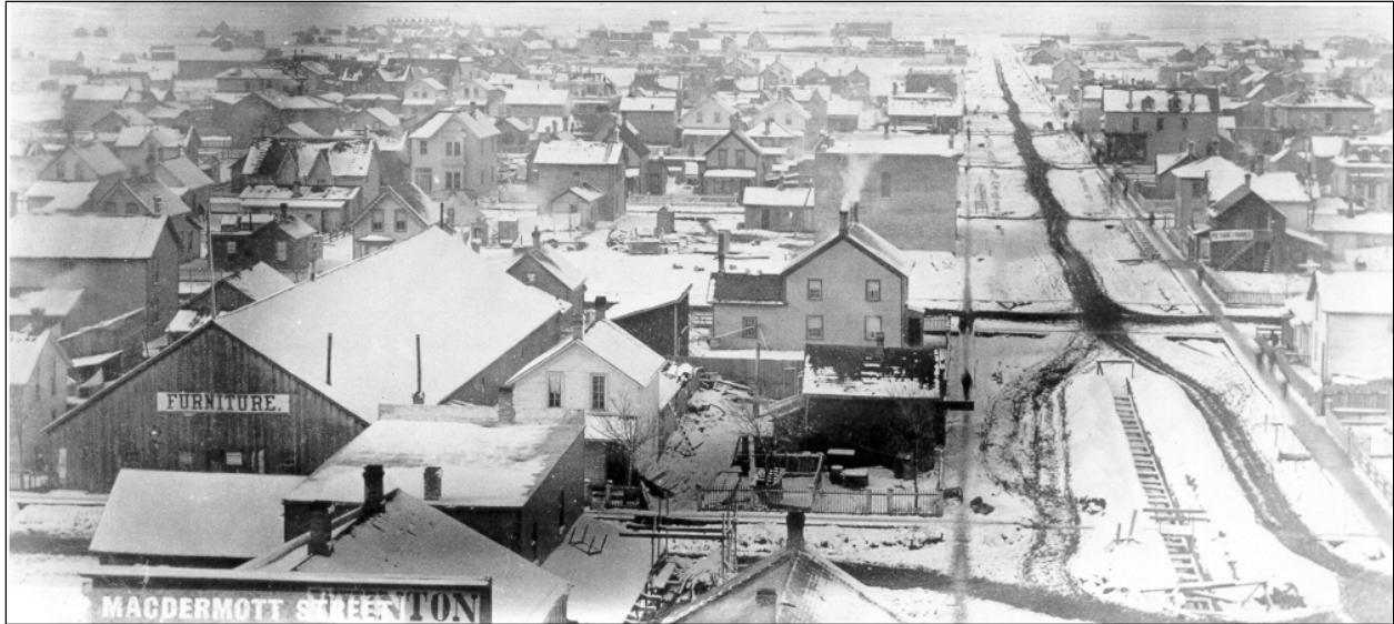
Plate 1 – McDermot Avenue looking west from Main Street, ca.1881. Note the extensive number of homes in the area.