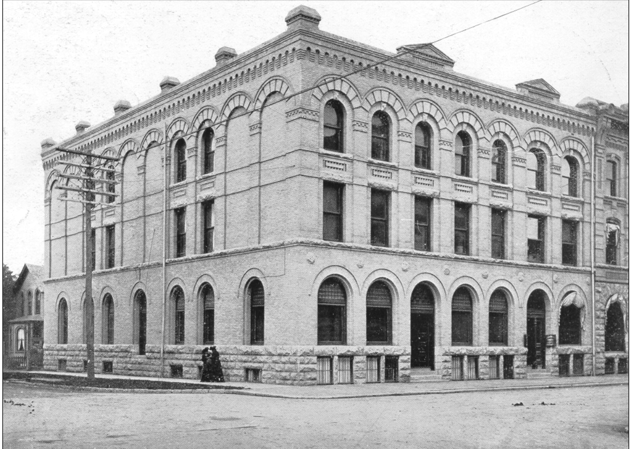
Plate 3 – Kenneth Mackenzie Co. warehouse, 78 Princess Street, ca.1903.