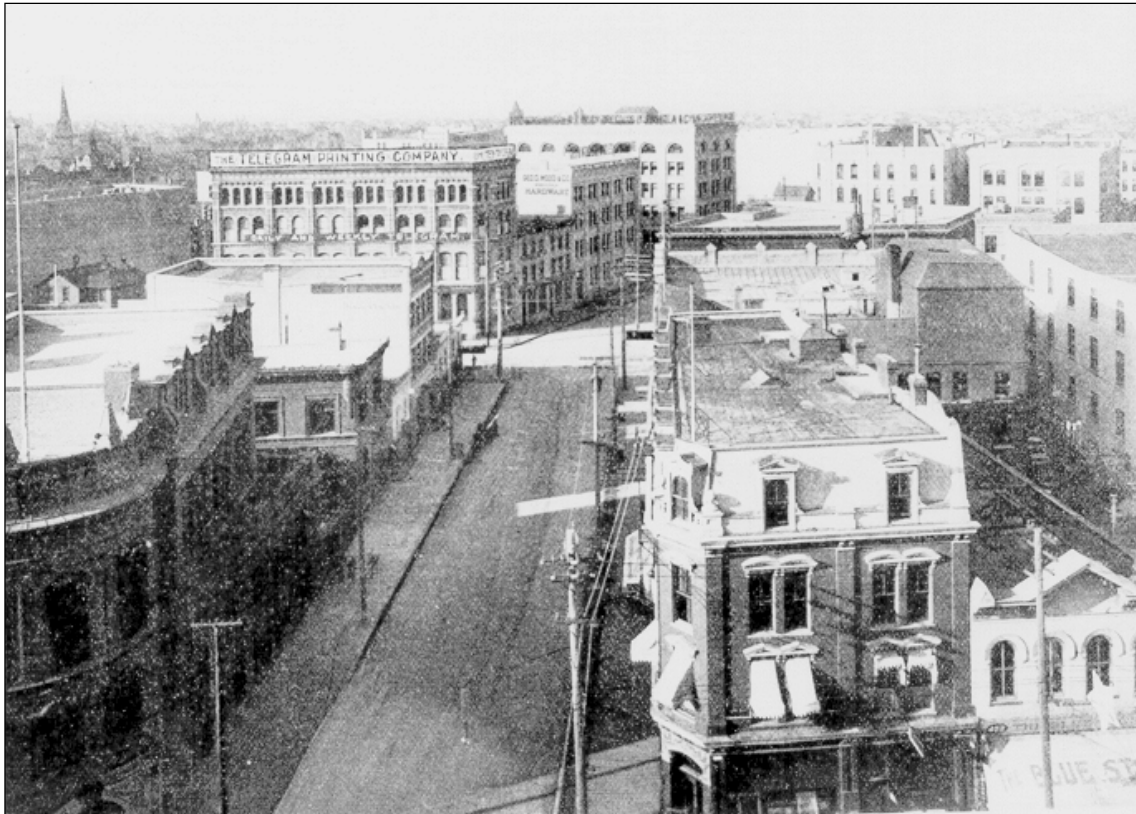
Plate 2 – The same view of McDermot Avenue as in Plate 1. This ca.1910 photograph shows the change in the area over 30 years.