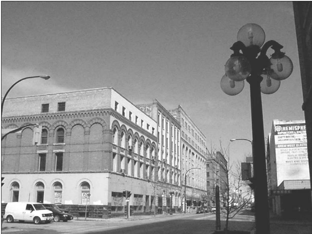
Plate 7 – Princess Street looking south from Bannatyne Avenue. (M. Peterson, 1998.)