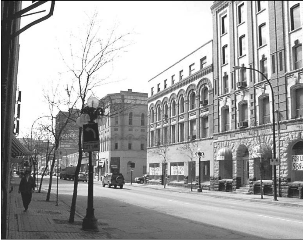
Plate 6 – Princess Street looking north from McDermot Avenue. (M. Peterson, 1998.)