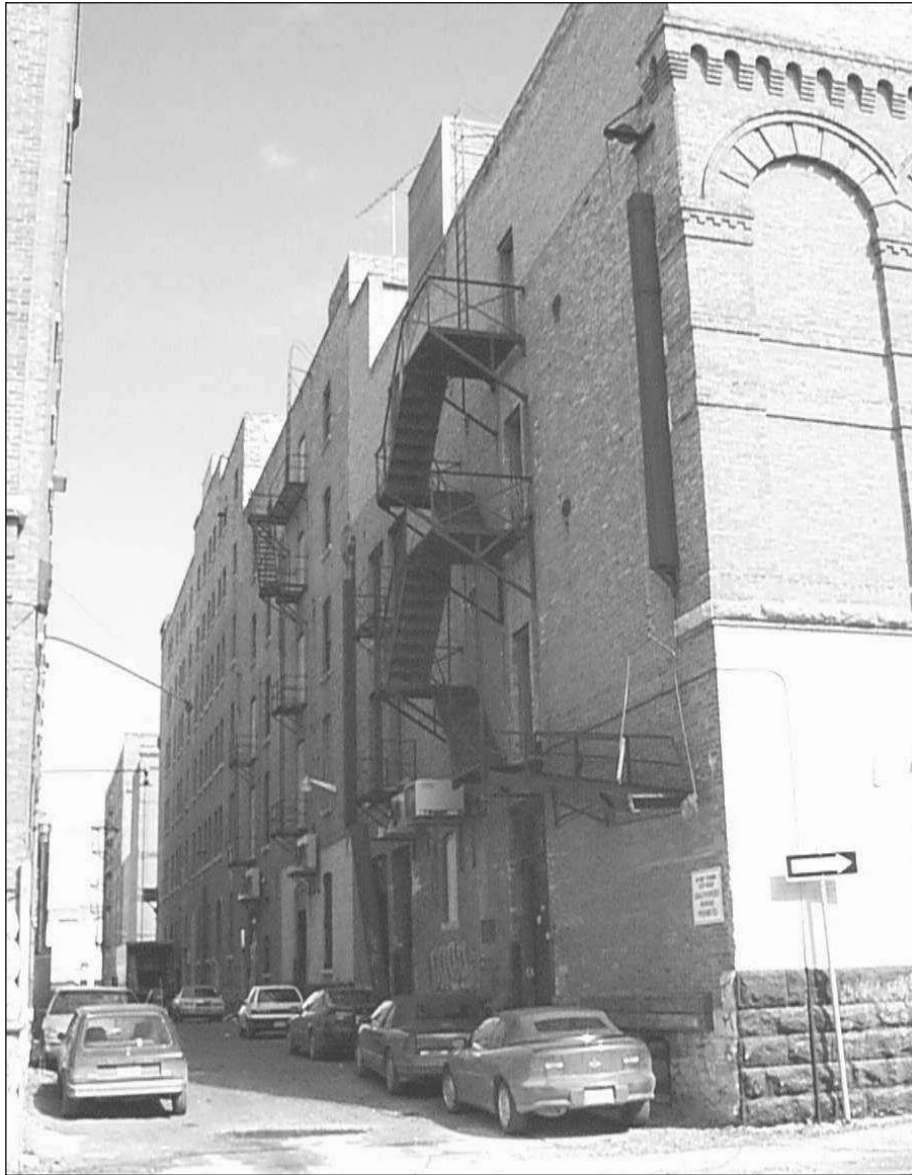
Plate 4 – 78 Princess Street, rear (west) façade.