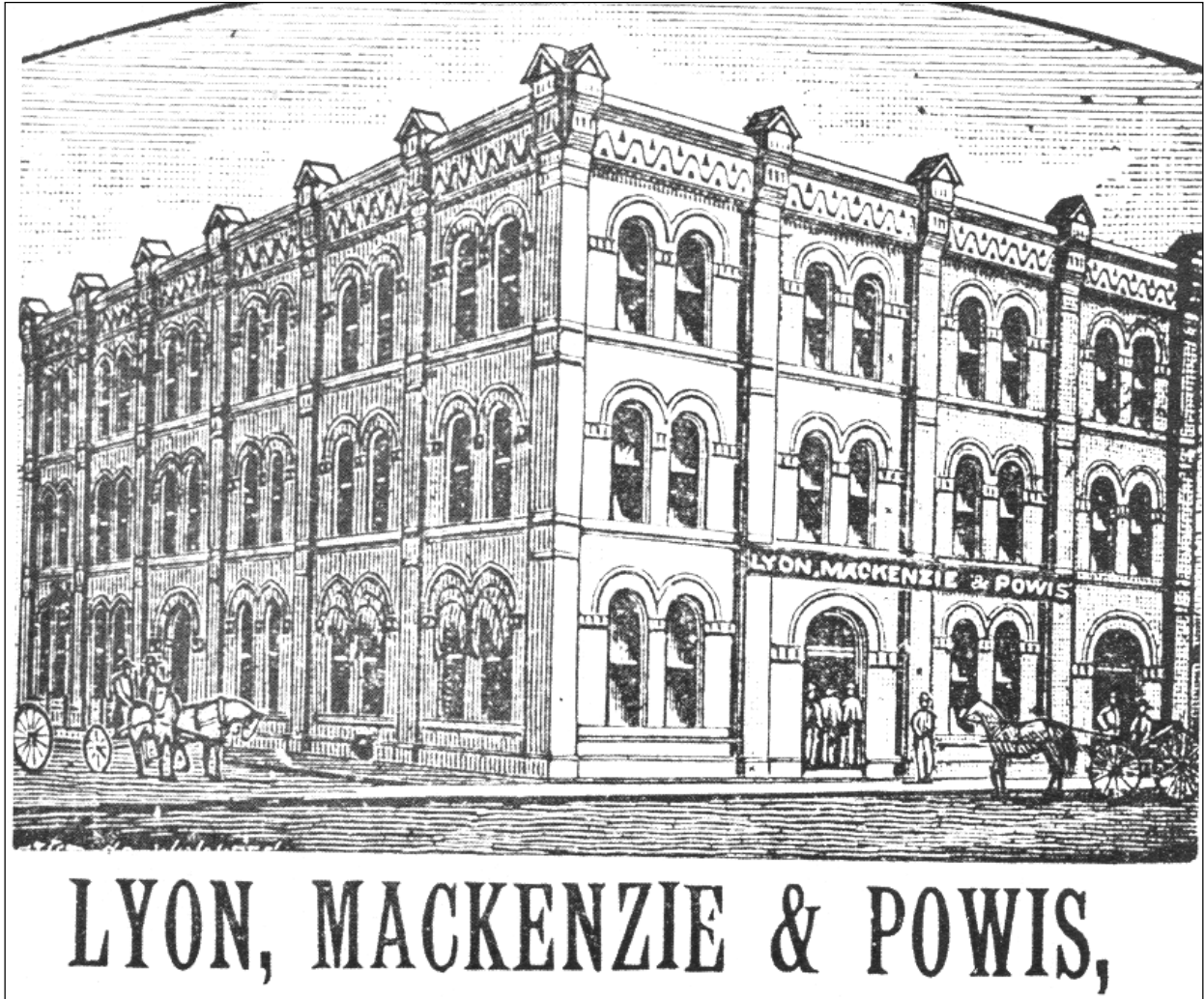
Plate 8 – Advertisement for the wholesale grocery firm of Lyon, Mackenzie and Powis.