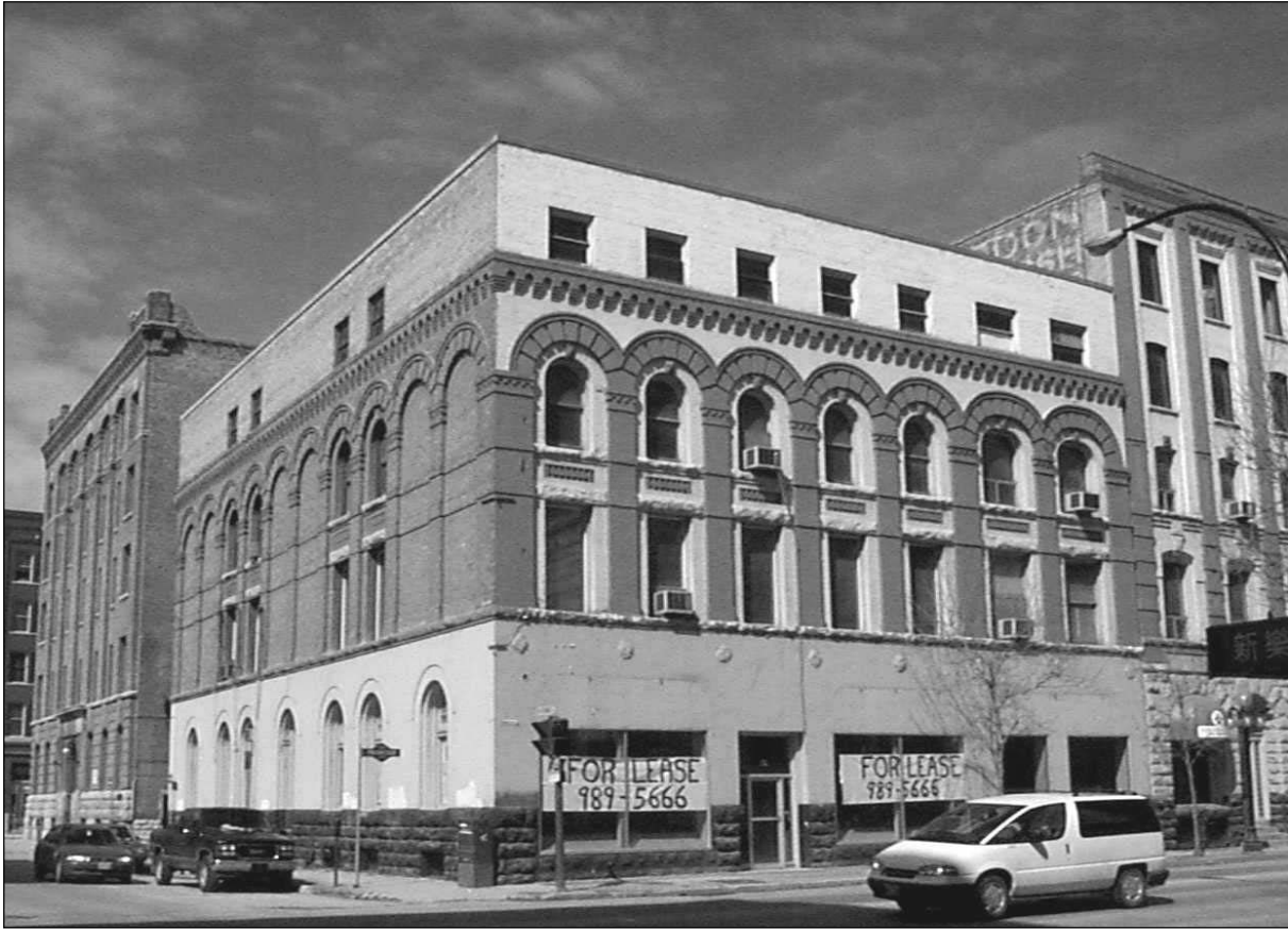
Plate 5 – 78-84 Princess Street, south and east façades.