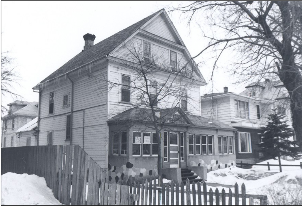
Front (south) façade, 1978