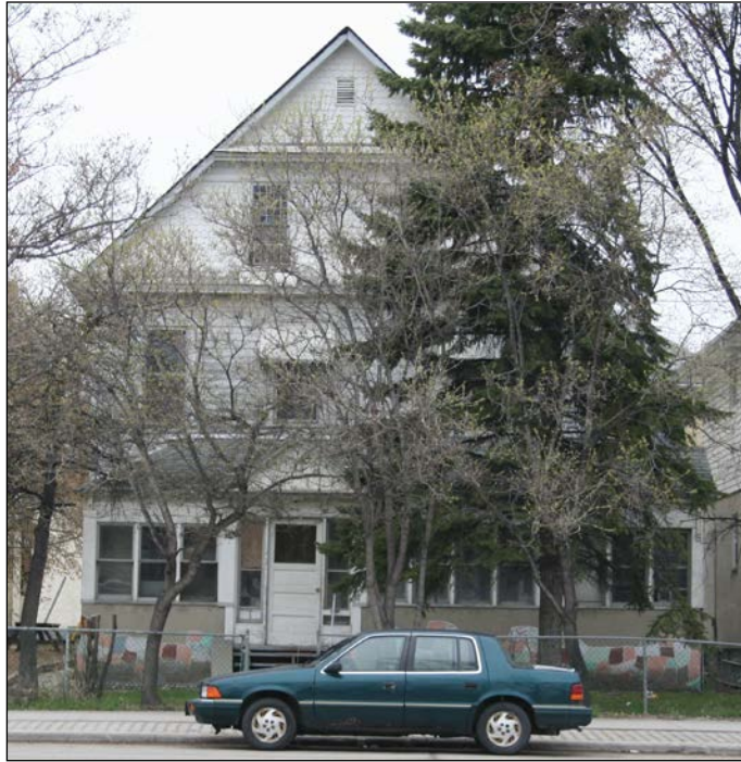
Front (south) and east façades, 2009

The structure is an example of the Queen Anne style which borrowed heavily from English architecture of the 15 th century, blending classical and medieval motifs into a picturesque form. 1 The desired asymmetry was achieved through a number of combinations of porches, bay windows, projecting wings, balconies and other devices. Roofs were usually irregular and complex, with dormers, gables and ornamental chimneys. Variations in materials and colours were also used to animate the façades. Given this freedom of design, however, accomplished designers were still able to create balance in the structures, offsetting busy surfaces by placing calmer elements nearby. 2