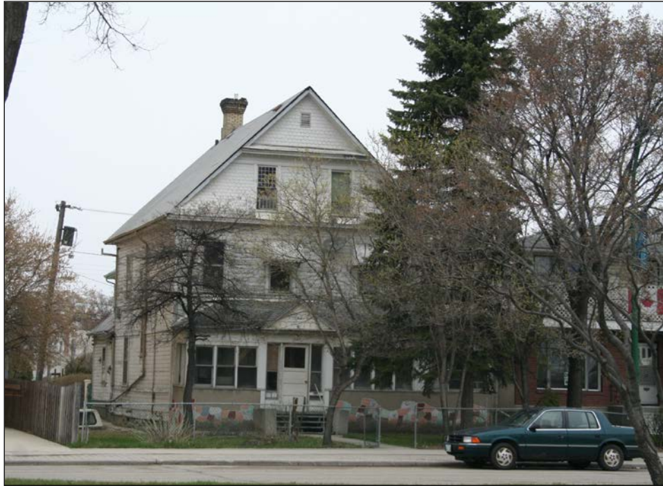
Front (south) and west façades, 2009