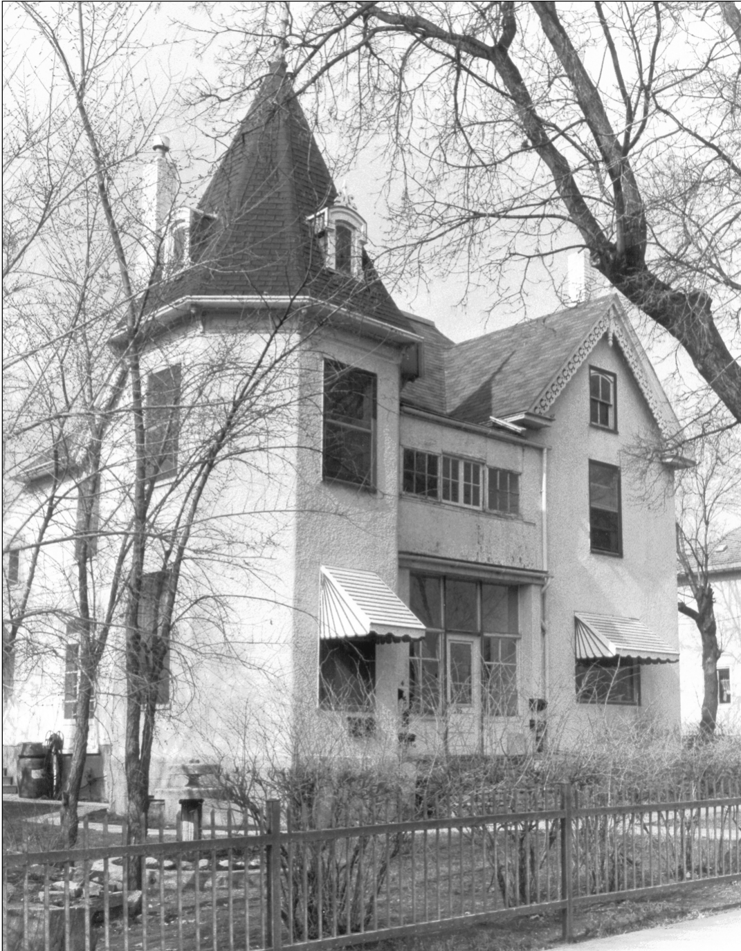
Plate 10 – Bernier House, 1889. (City of Winnipeg Planning Department.)