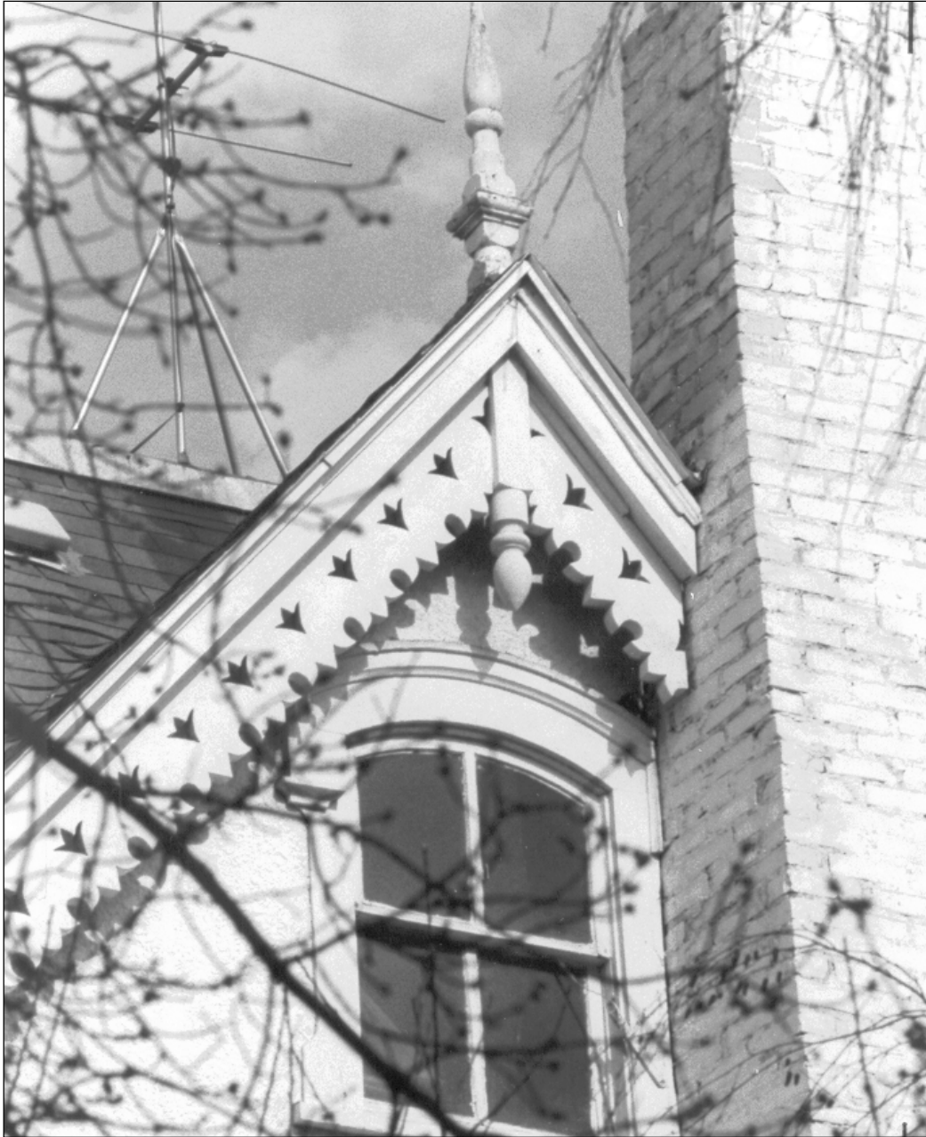
Plate 11 – Detail of original window gable and ornamentation, 1989.