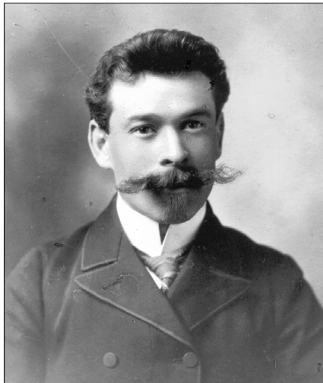
Plate 3 – Joseph Bernier, 1900.