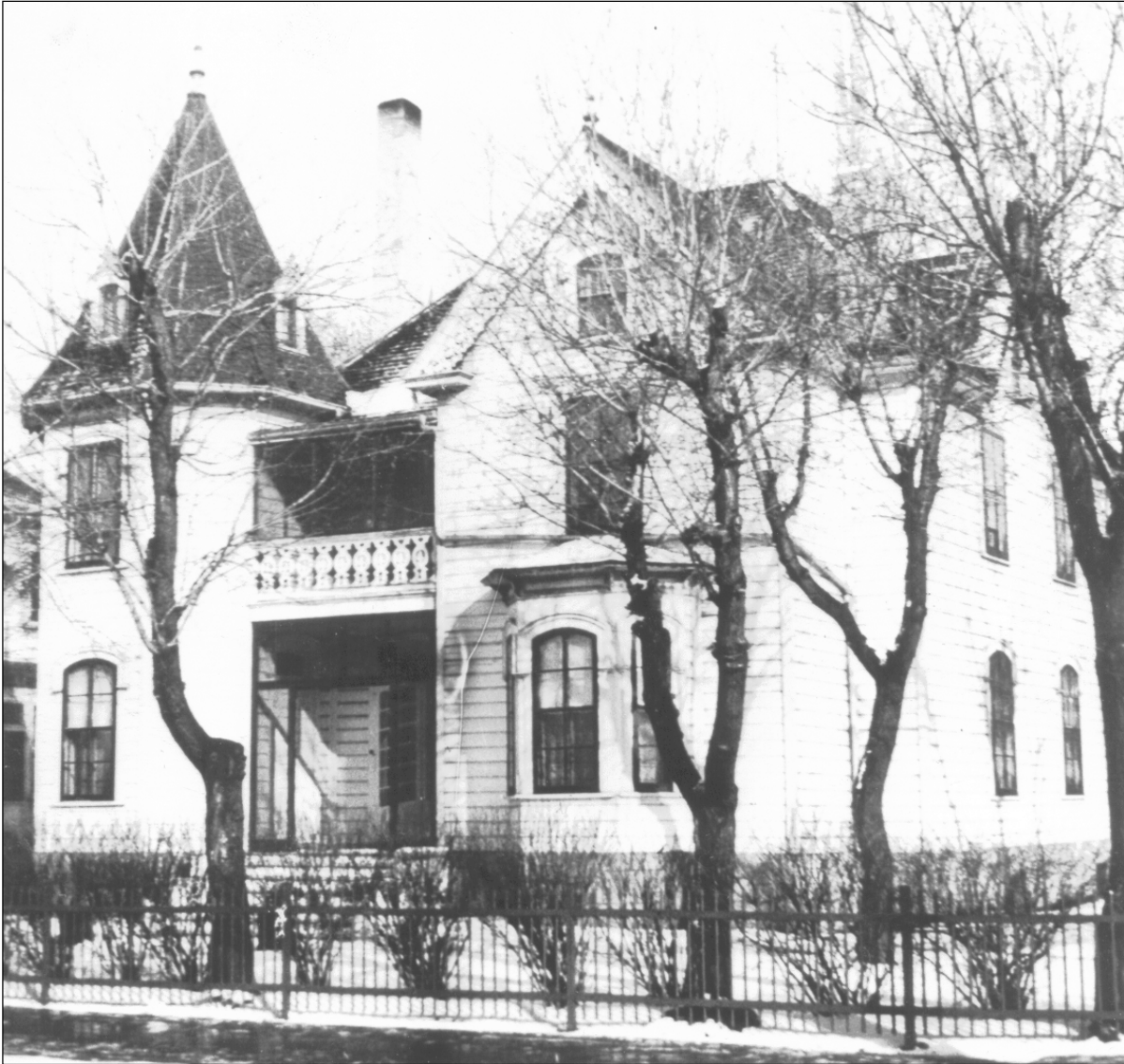
Plate 8 – Bernier House, 265 Boulevard Provencher, 1938.