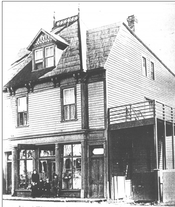
Plate 7 – The Keroack book store, St. Boniface, no date.