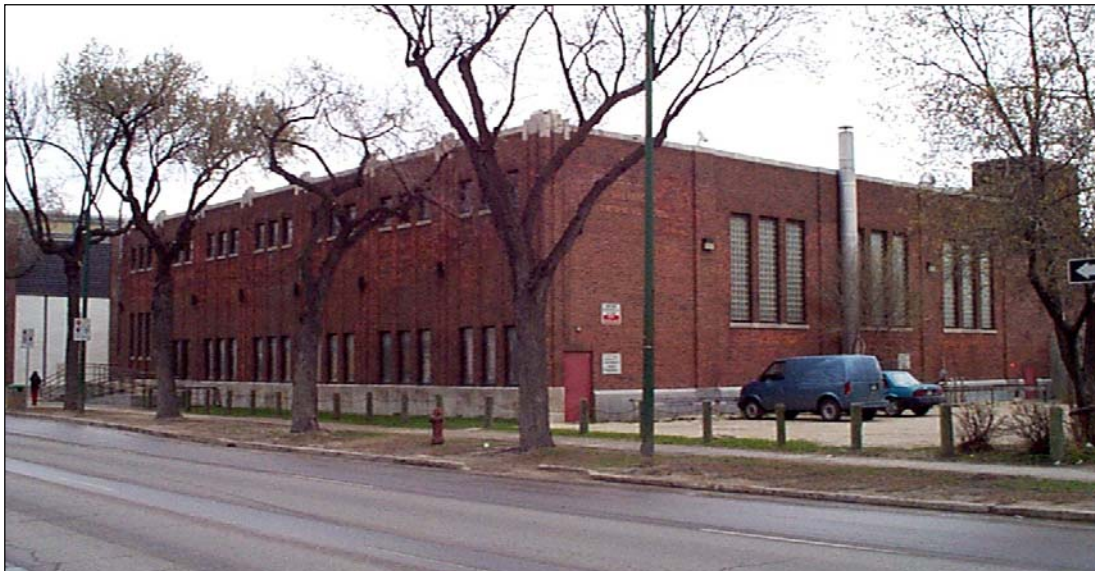
Plate 6 - Sherbrook Pool, 381 Sherbrook Street, front and south façades.