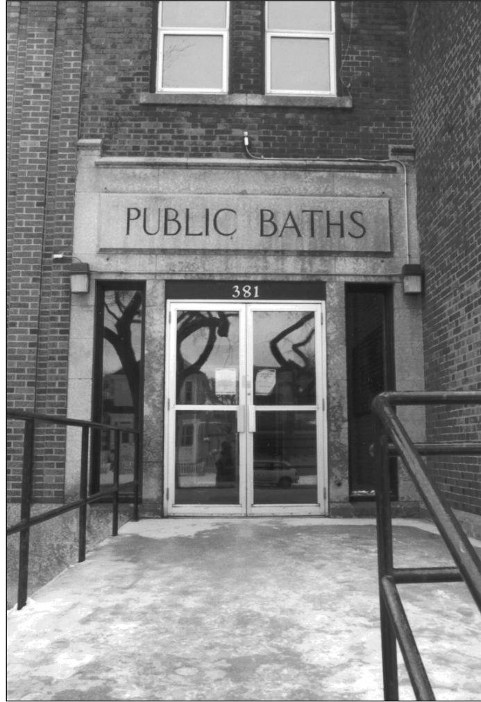
Plate 7 - Sherbrook Pool, 381 Sherbrook Street, main entrance.