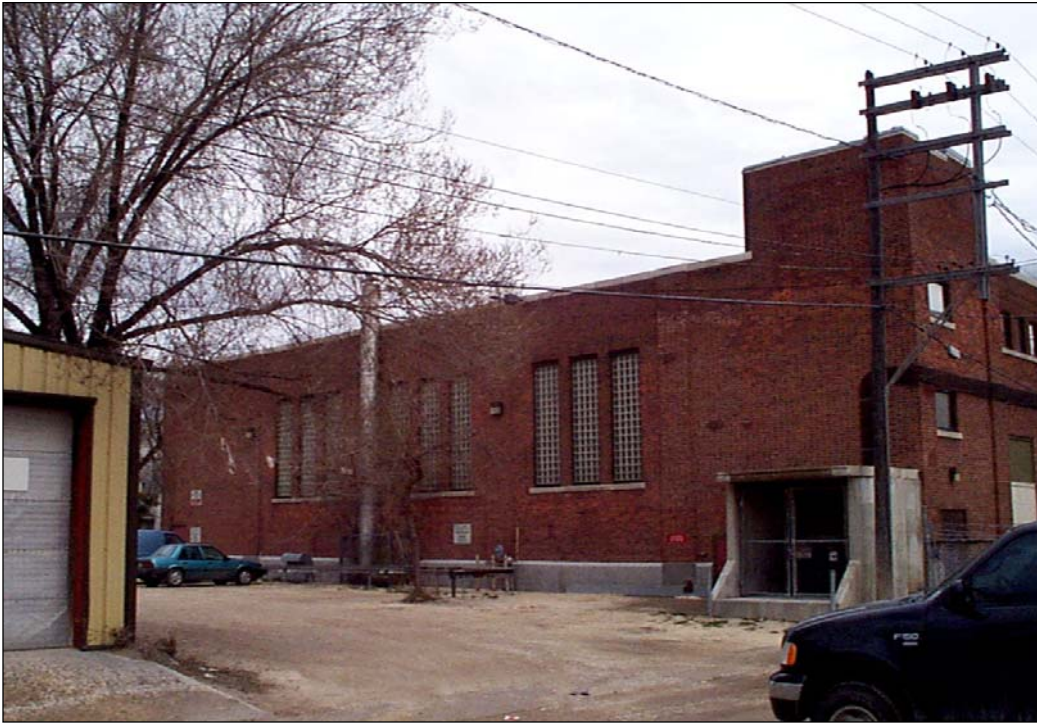
Plate 5 – Sherbrook Pool, 381 Sherbrook Street, south façade. ( Murray Peterson, 2001. )