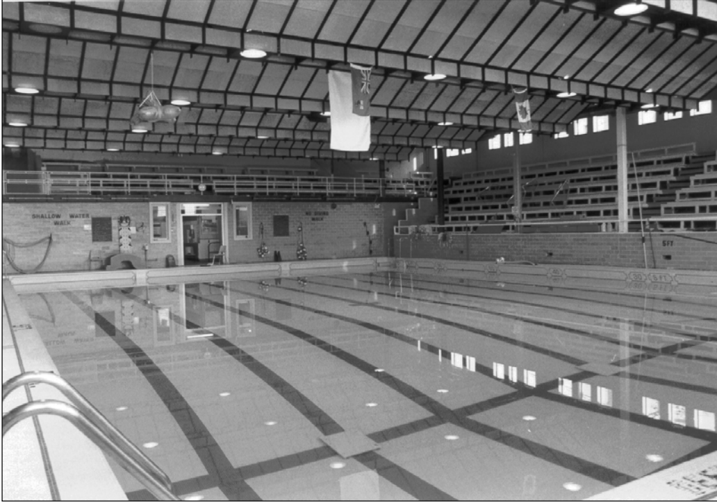
Plate 8 – Sherbrook Pool, interior. (Murray Peterson, 1995.)