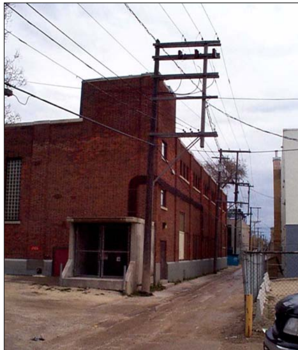
Plate 4 – Sherbrook Pool, 381 Sherbrook Street, rear (east) façade. ( Murray Peterson, 2001. )