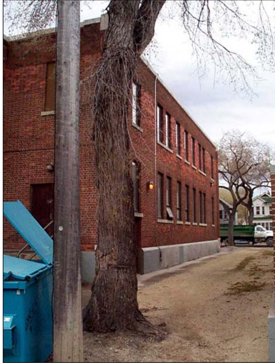
Plate 3 – Sherbrook Pool, 381 Sherbrook Street, part of rear (east) and north façades. ( Murray Peterson, 2001. )