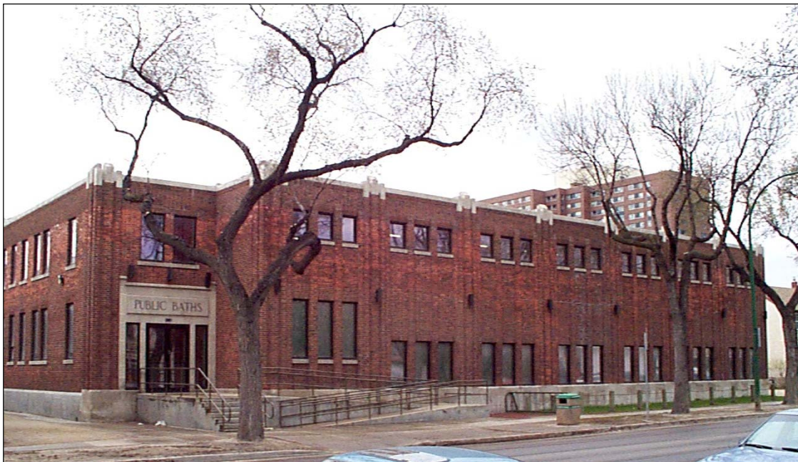
Plate 2 – Sherbrook Pool, 381 Sherbrook Street; built 1930, architects Pratt and Ross; front (west) façade.