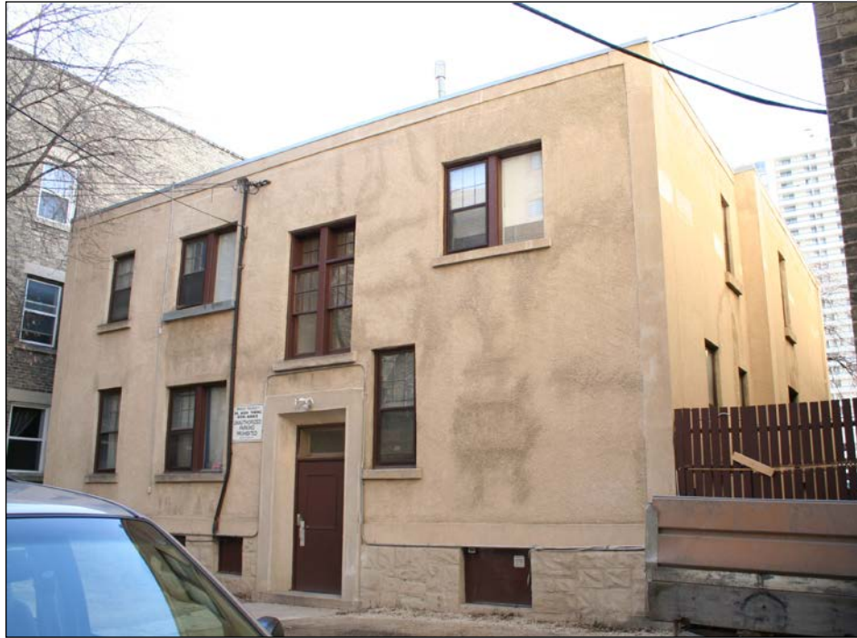
Rear (east) and north façades, 2006