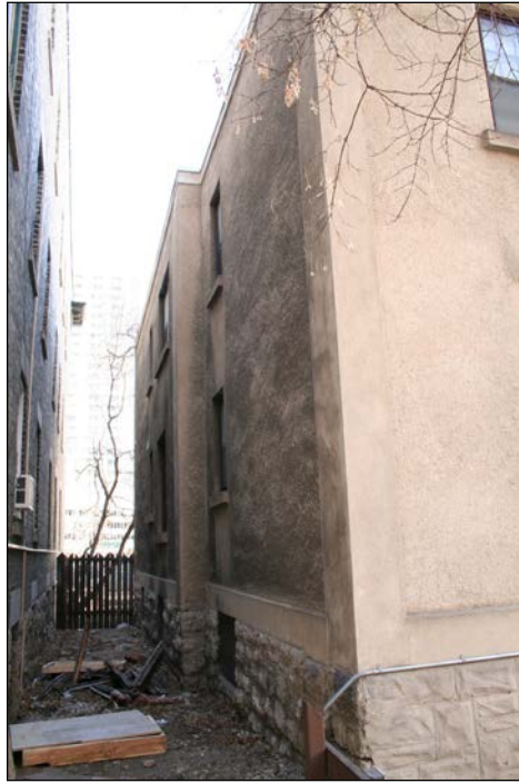
South façade, 2006