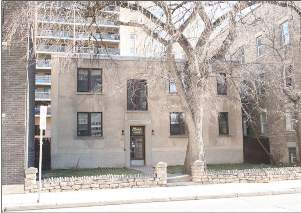
Front (west) façade (note the low stone fence), 2006

The other three elevations of this block are similarly designed and feature the same finishes.