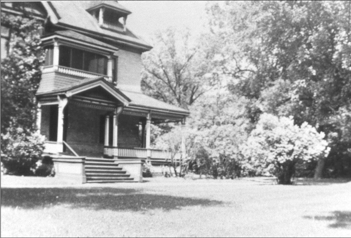
Plate 4 – 134 West Gate, 1947. Note the small dormer above the porch which was later removed and then rebuilt by the present owner. ( Courtesy of C. Singh ).