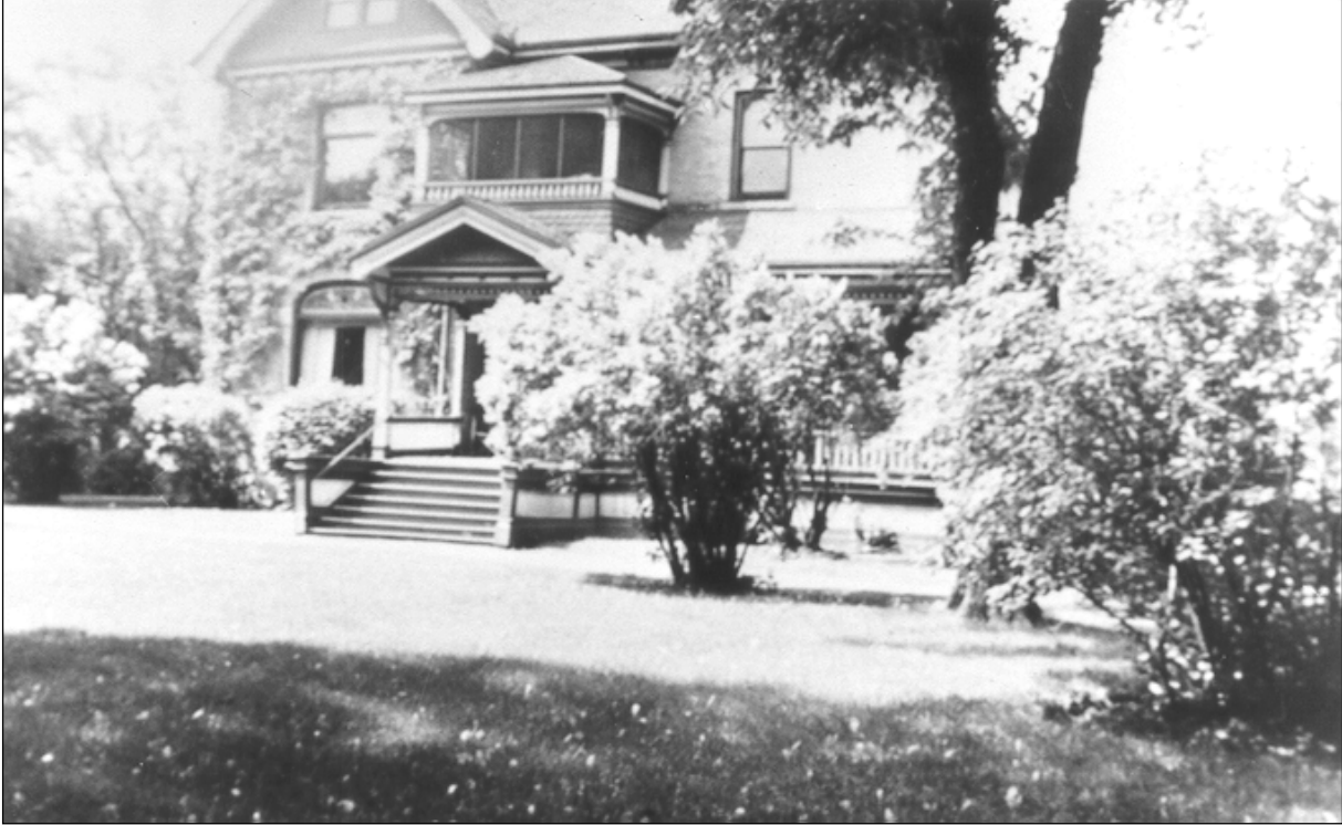
Plate 3 – “Beechmount”, 134 West Gate, ca.1908. This picture shows the extent and beauty of the original wooden porch.