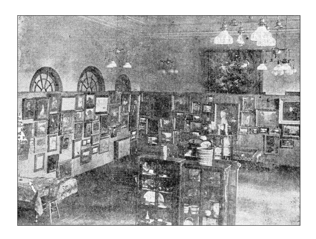
Plate 5 – A view of the second floor interior, 1912.