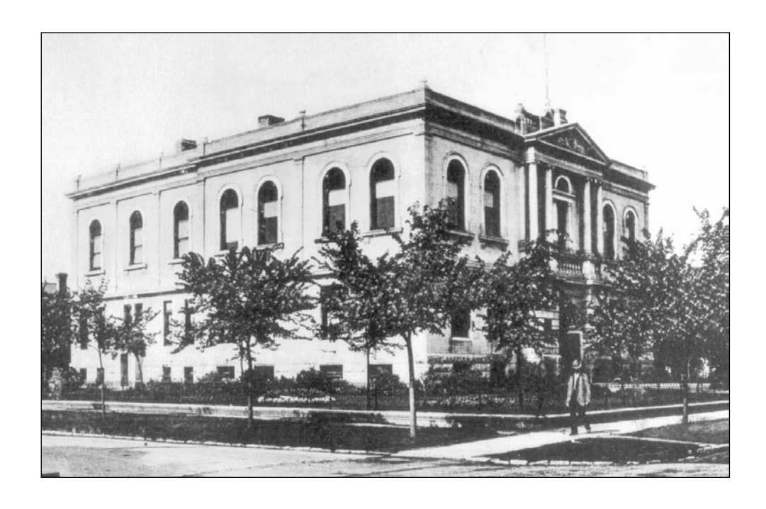
Plate 4 – Carnegie Library shortly after its addition, ca.1910.