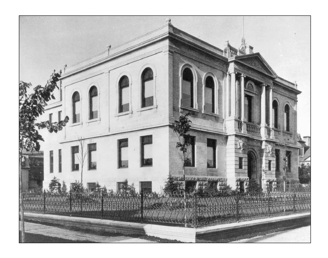
Plate 2 - Another shot from this period, ca.1905.