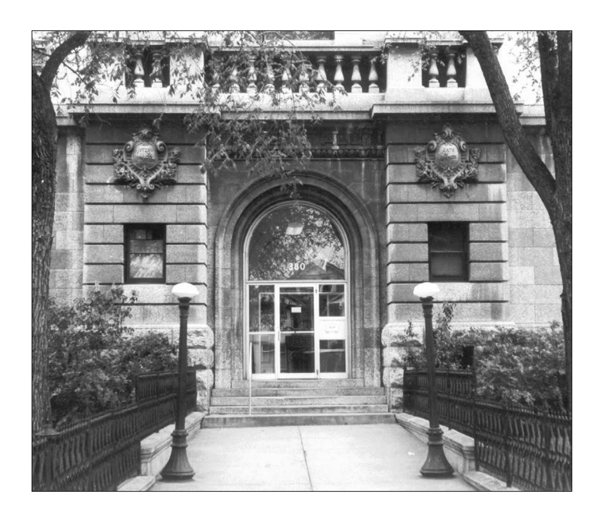
Plate 7 – Front entrance, 1969.