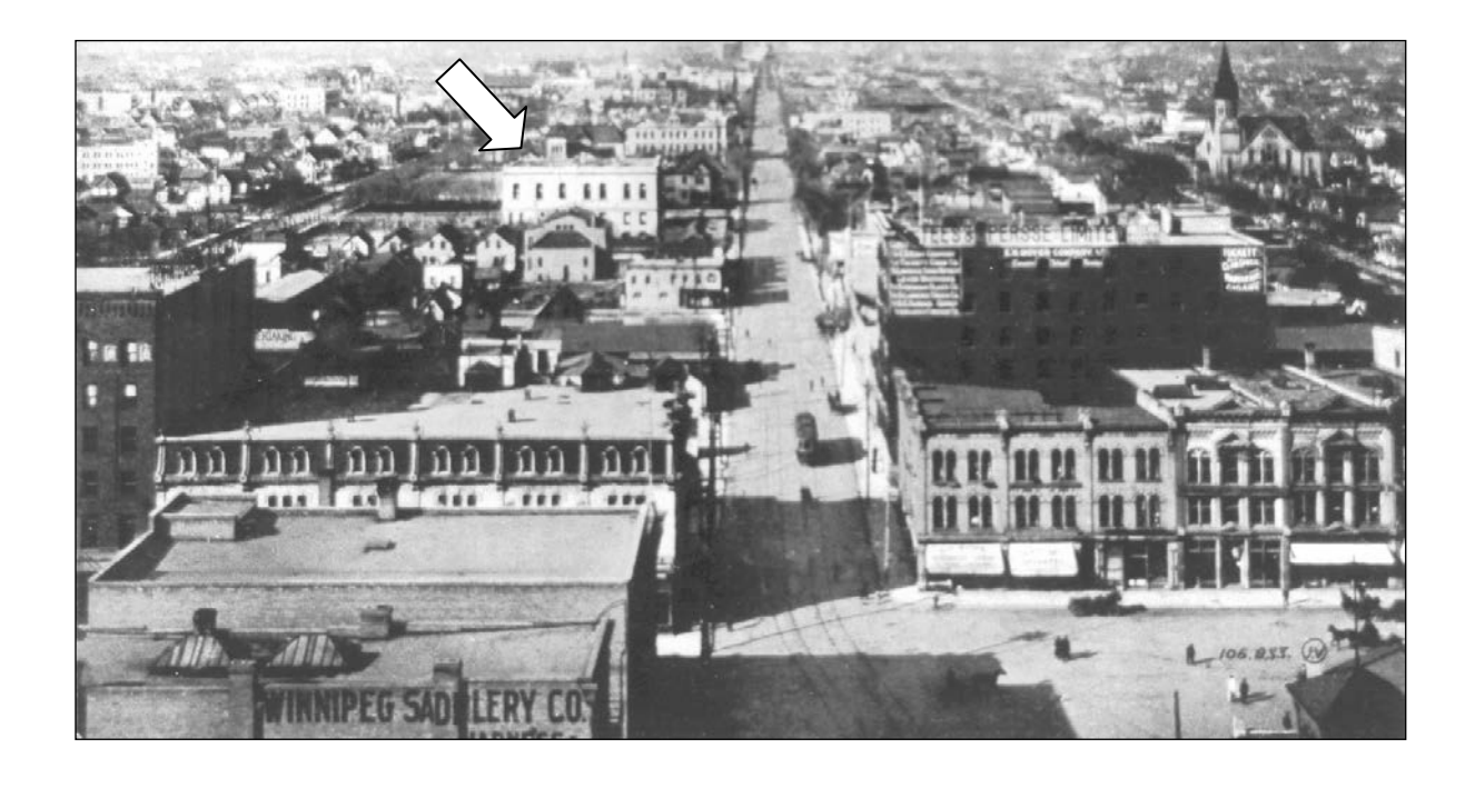
Plate 6 – Looking west down William Avenue, ca.1912, Carnegie Library at arrow.