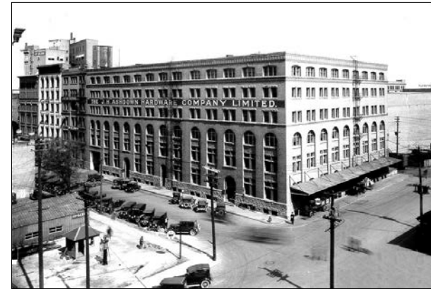
J.H. Ashdown Company Warehouse