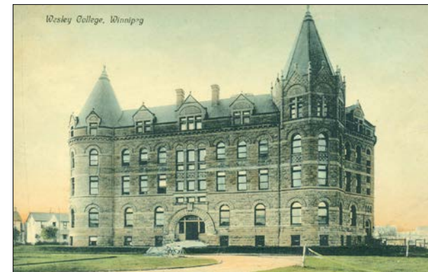
University of Winnipeg, Wesley Hall