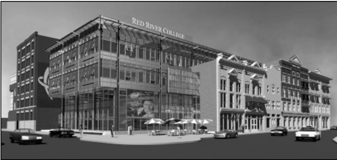
An artist's perspective of the Red River College Princess Street Campus. (Courtesy of Corbett Cibirel Architects) Conceptual Rendering

Listed buildings are classified by a grade system: