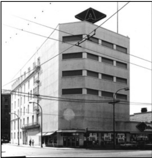
Former J.H. Ashdown Building.

The school was built in 1921, one of eight one-storey schools built by the Winnipeg School Board during 1920-21 to provide modern facilities to its quickly growing school population. The nine-room, L-shaped school cost $125,000 to complete, including site costs. It was named after Colonel Garnet Joseph Wolseley (1833-1913), a career British officer who led a military expedition from Eastern Canada in 1870 to take control of the new Province of Manitoba.