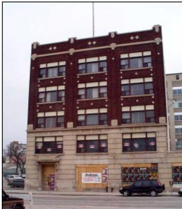
Former Film Exchange Building.

The increased popularity of motion pictures in the 1920s gave rise to the Film Exchange, a centralized storage, repair and distribution facility. Winnipeg's modern five-storey Film Exchange Building was completed in 1922. An unusual feature of the design was an interior ramp providing direct vehicle access to the basement and to storage/distribution areas on the first and second floors. Film distributors continued to occupy parts of the building into the 1970s.