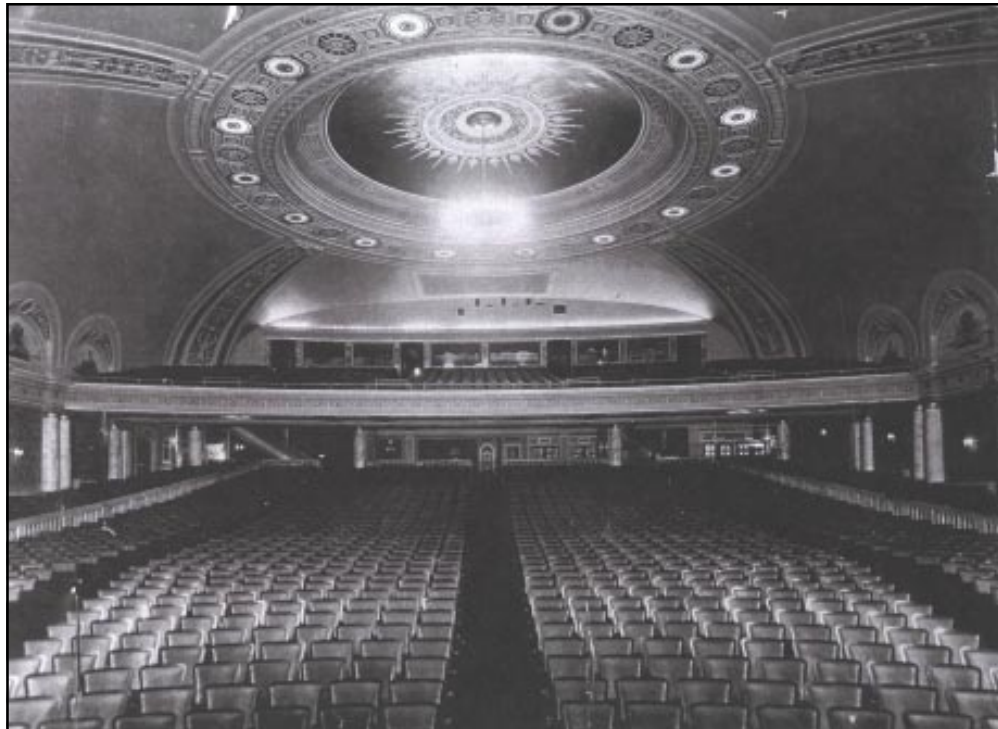
A early 1920 photograph of the magnificent original interior of the Capitol Theatre.

The Winnipeg Architecture Foundation with financial assistance from the Historical Buildings Committee completed the “ Recent Landmarks Inventory. ” The inventory includes documentation of 190 of downtown Winnipeg’s significant buildings constructed between 1940 and 1975.