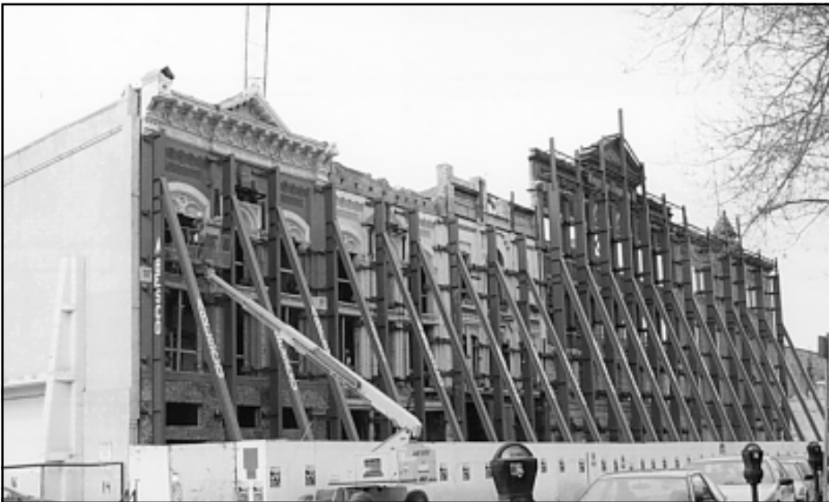
Top photo: The Princess Block as it stood prior to rehabilitation for the Red River College Downtown Campus.