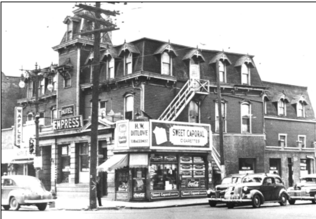
The New Brunswick Hotel as it stood as the Empress Hotel prior to the 1953-54 renovations and renaming (courtesy of the University of Manitoba Archives).

Completed in 1907, this three-storey solid brick building featured retail space on the ground floor with large display windows and pressed-tin ceilings. The second and third floors originally had four residential suites each, with a common bathroom on each floor. Commercial tenants included a grocer, a hardware merchant, a tailor, a billiards room and finally a delicatessen prior to demolition in the spring of 2001.