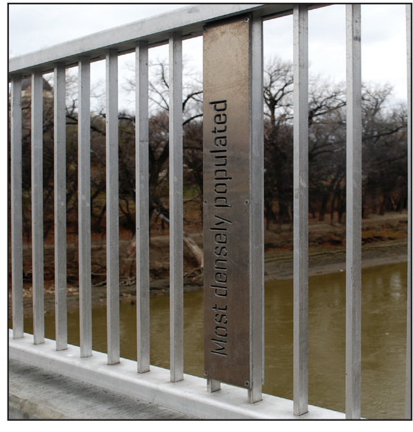
Inscribed Handrail Picket