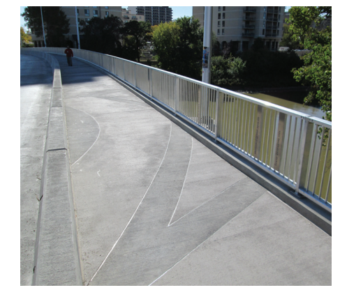
Neighbourhood Streets Imbedded in Sidewalk

celebrating four important architectural elements of the neighbourhood's history (the Legislative Building, the Granite Curling Club, the Roslyn Court Apartments and the Evergreen Towers).