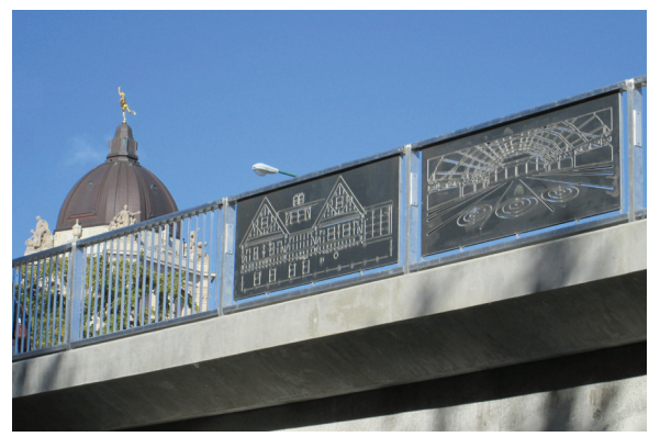
Gateway Art Panels

Watch for information about an upcoming celebration of this remarkable new artwork. Details coming soon to www.winnipegarts.ca.