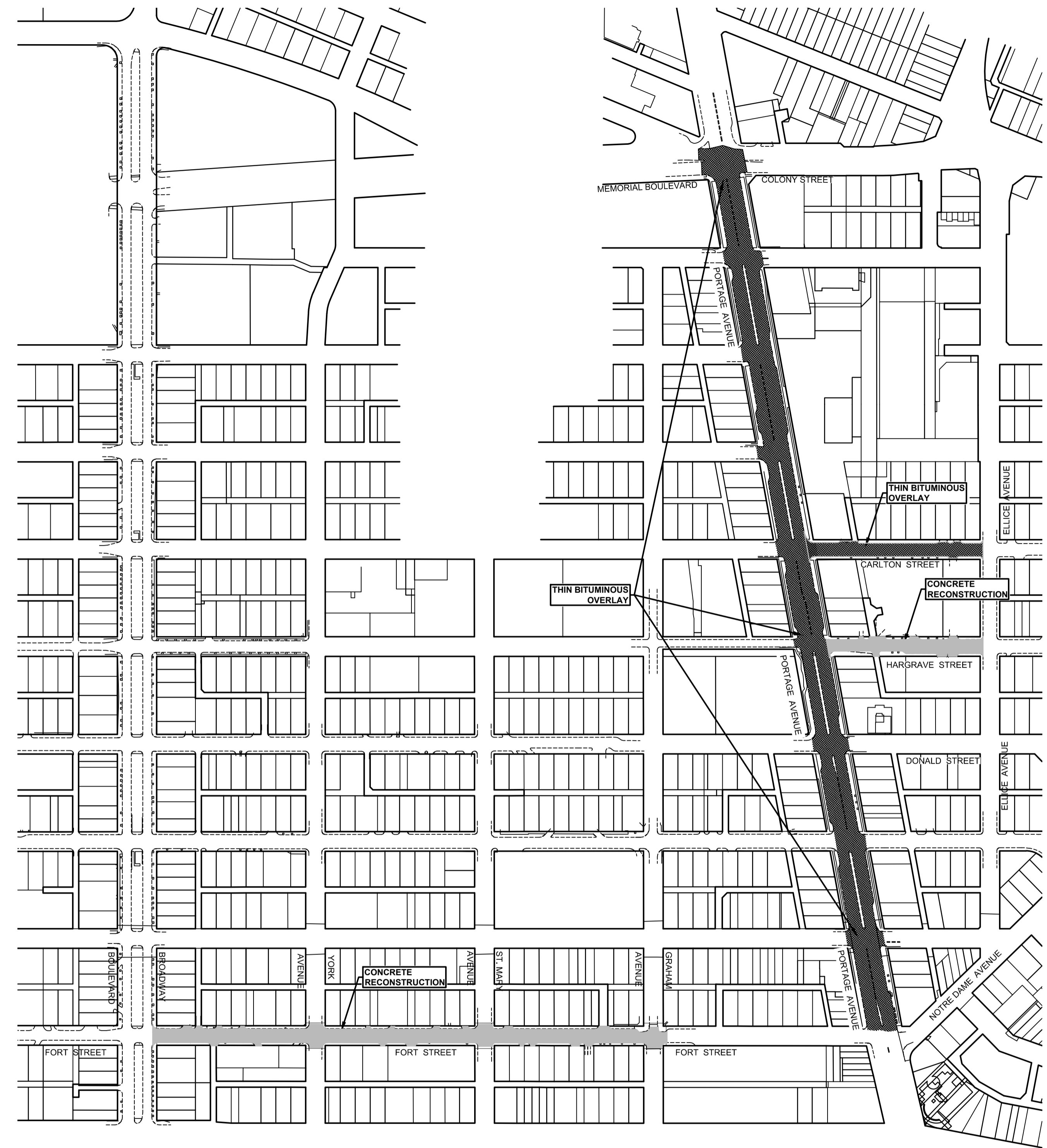
GENERAL ARRANGEMENT PLAN