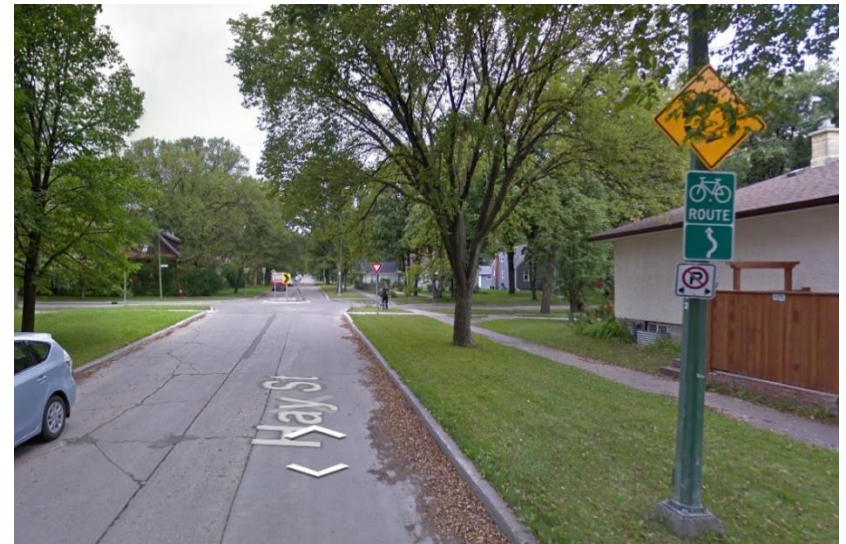
Bike Route Signage; Traffic Calming Circle