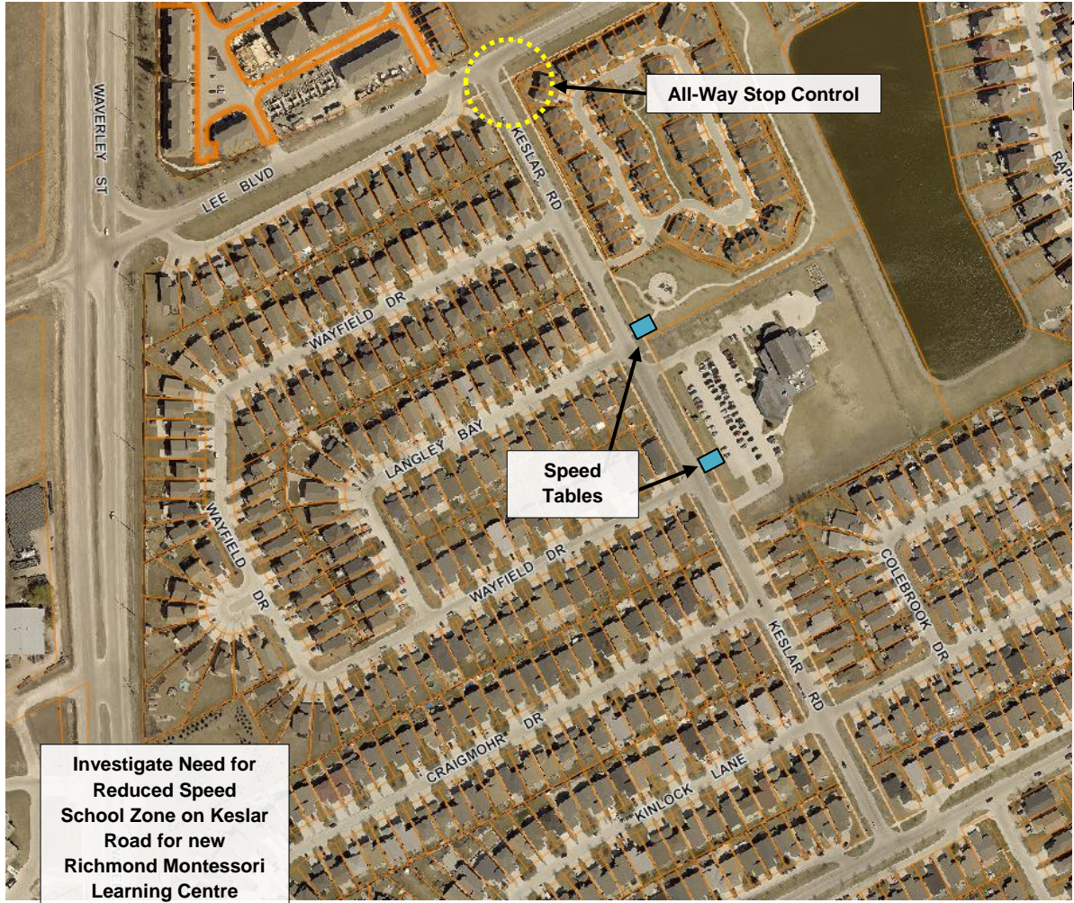
Figure 2: Recommendations for Keslar Road