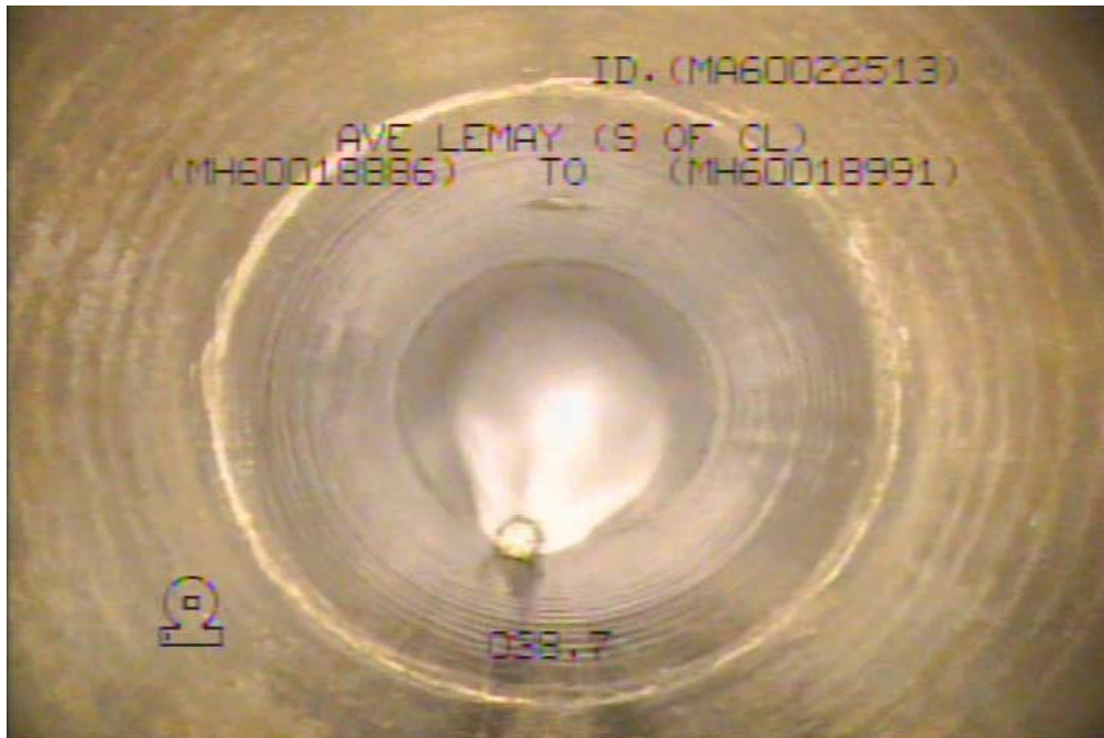
Figure 3 – 900 mm concrete land drainage sewer pipe in good condition.