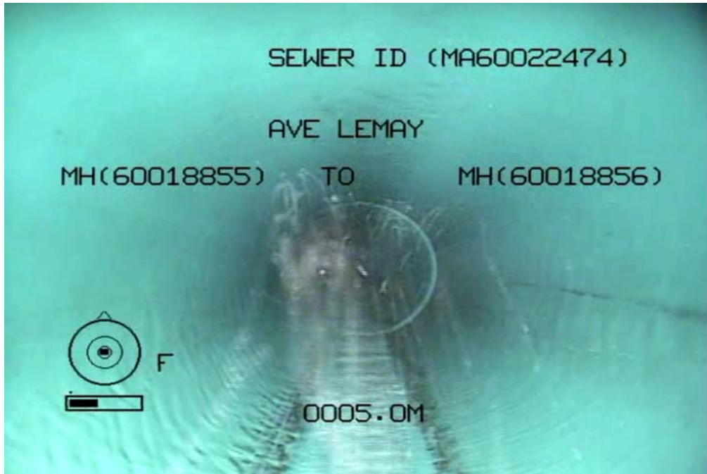
Figure 1 – 300 mm PVC land drainage sewer pipe in good condition.