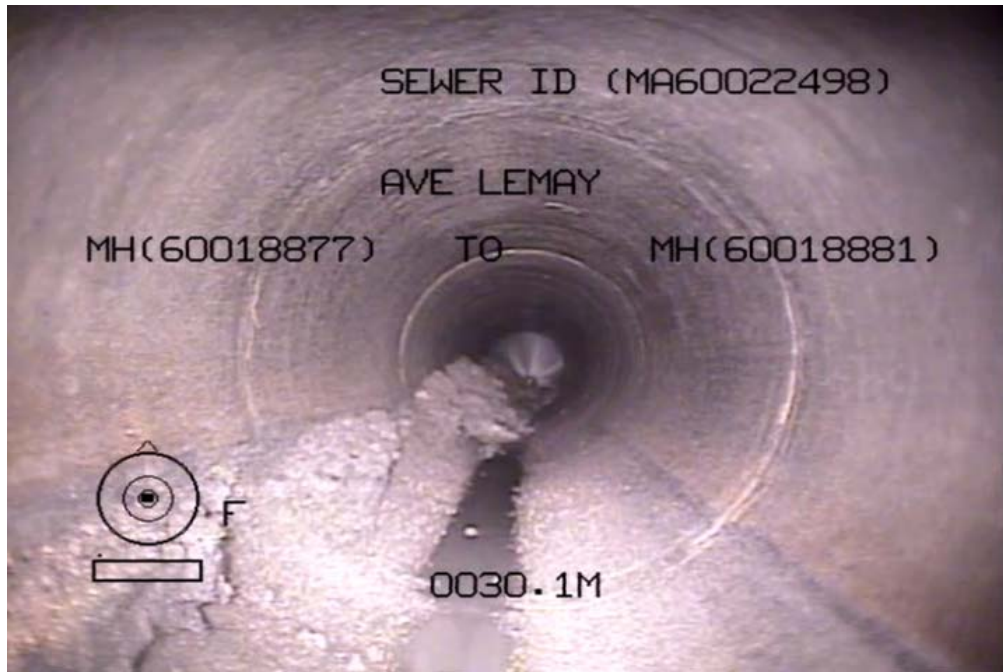
Figure 5 – Silt debris in 750 mm diameter land drainage sewer on Avenue Lemay. Before cleaning, there was an estimated 20 to 25% build-up of debris in the pipe.