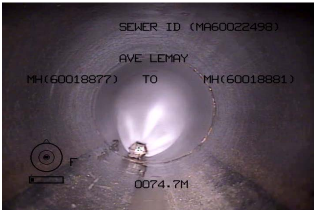
Figure 2 – 750 mm concrete land drainage sewer pipe in good condition.