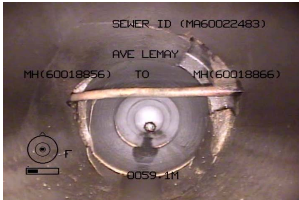
Figure 6 – 19 mm water service through 300 mm diameter land drainage pipe on Avenue Lemay.