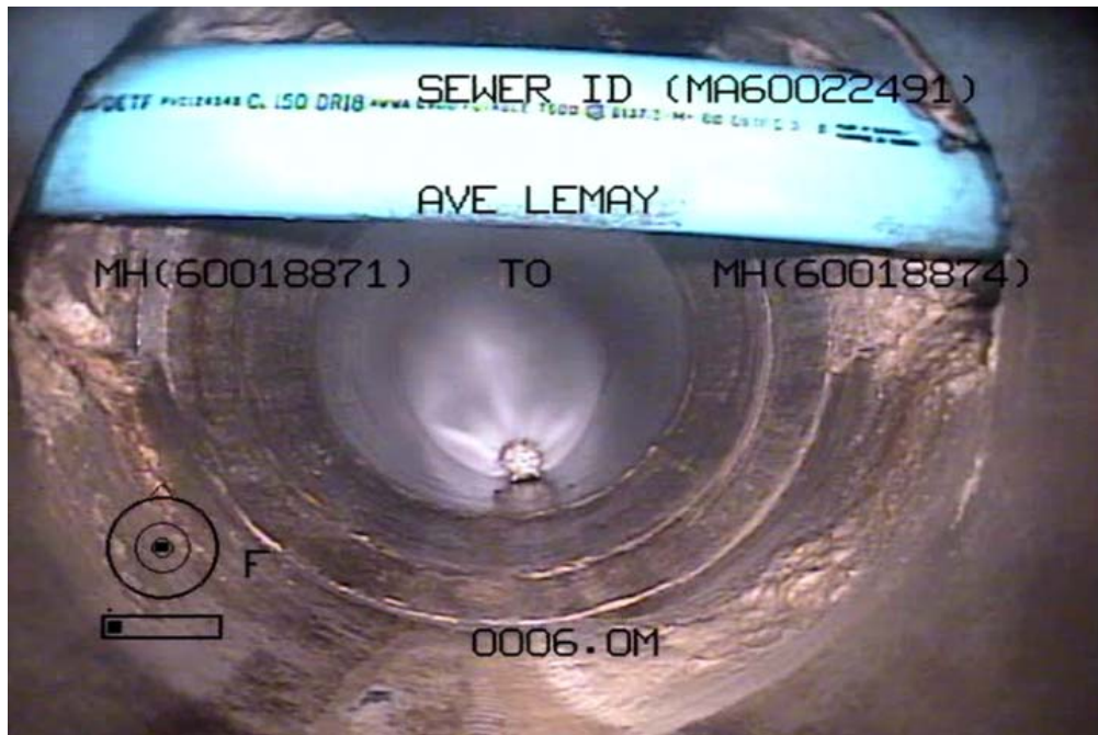
Figure 7 – 150 mm diameter PVC water main through 750mm diameter land drainage sewer on Avenue Lemay.