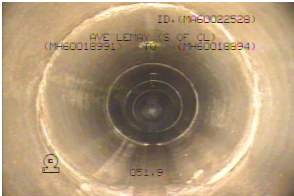
Figure 4 – 900 mm concrete land drainage sewer pipe in good condition.